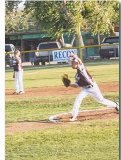
Hayden and Kearny Little League Minor All Stars faced off Saturday in Hayden.