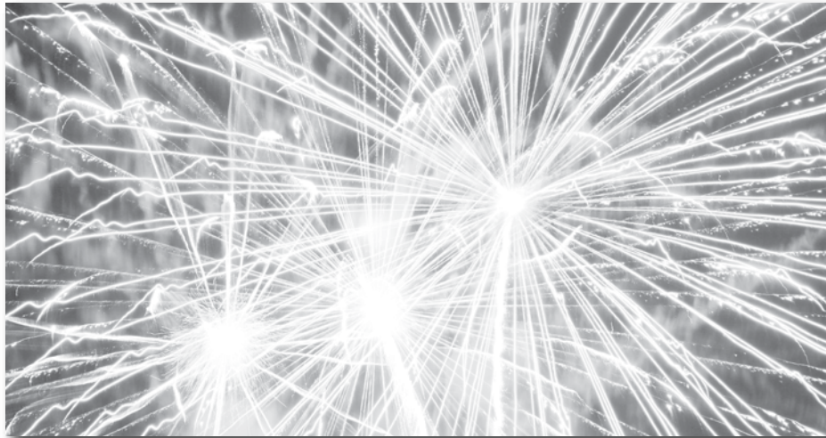
Apache Sky Casino and the Town of Hayden will be hosting fireworks displays for the Fourth of July (the casino's display is on July 1).

The summer heat does terrible things to our yards. Weeds grow and good plants wither, even cacti. Let's keep up the curb appeal of our yards.