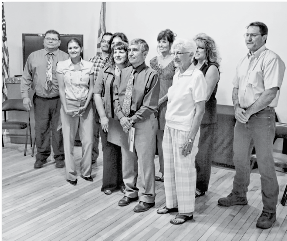
Freeport-McMoRan presented the Cobre Valley Institute of Technology with a grant.

• Southern Gila County Economic Development Corporation – $55,000: Funds will be used for a wayfinding and signage project to help