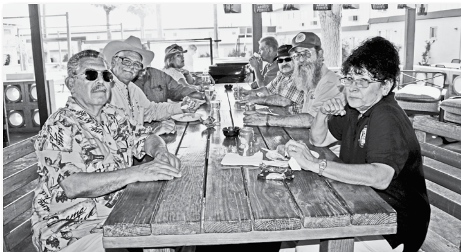
Group enjoying all the good eats at the customer appreciation party hosted by Ray Federal Credit Union..