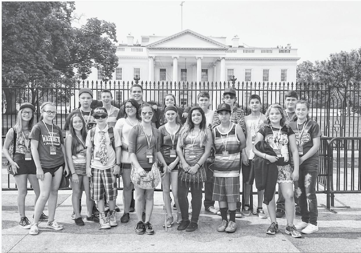
Ray students in Washington, DC, pose in front of the country's most famous House.