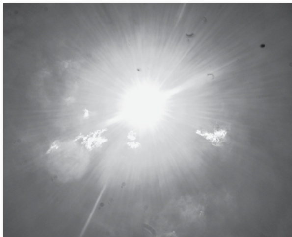
The sun promises to be brutal this summer. Are you ready?

There are many more volunteer jobs available. If you are interested, please contact: SaddleBrooke Community Outreach located in Suite "L" in the commercial center or call: 520-825-3302. Kids' Closet is open on Mondays, Thursdays and occasional Saturdays.