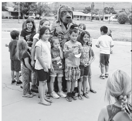
Having fun with McGruff the Crime Dog.

This year's Summer Reading Program Theme at the Kearny Library is "Super Heroes" which includes make believe Super Heroes and local heroes, such as our Police, Fire, EMTs and Air Evac.