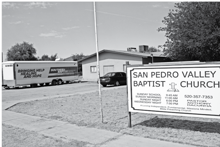
The Arizona Southern Baptist fed the clean up crew and the San Pedro Valley Baptist provided a place for them to rest.