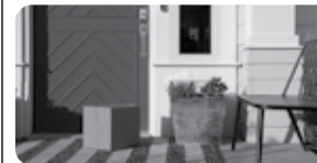
Know When People and Packages Arrive