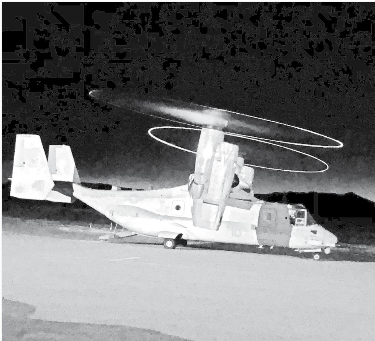
One of the two Ospreys that landed at the San Manuel Airport in 2018. Its flight crew was part of the Purple Foxes.

This Purple Foxes patch was presented to the San Manuel Airport in 2018 as a gesture of thanks for hosting the flight crews of two Ospreys. The Osprey and crew that crashed were also members of the Purple Foxes and were involved in flying night sorties near San Manuel a few years later. This patch is worn on the uniforms of the Marines serving with the Purple Foxes.