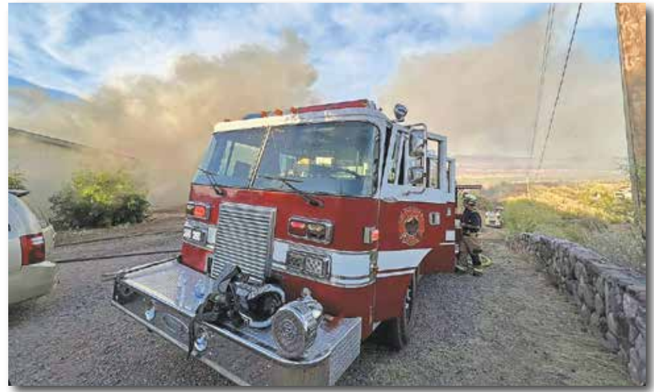
Firefighters from four departments battled a structure fire in Mammoth.