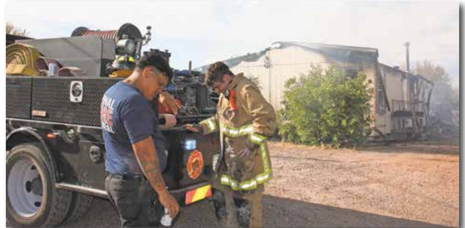
Firefighters take a break to cool off during the battle to extinguish a structure fire in Mammoth.