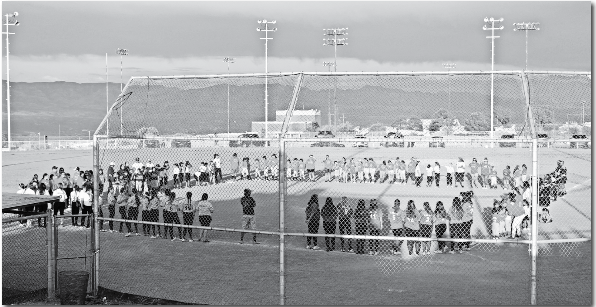
The Summer Softball League hosted opening ceremonies on Saturday in San Manuel. The League encompasses girls from Hayden, Mammoth, San Manuel and Oracle.

The Bath or Shower You've Always Wanted IN AS LITTLE AS 1 DAY