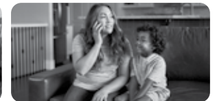
Peace of Mind Starts Here

Get FREE Professional Installation and Four FREE Months of Monitoring Service*