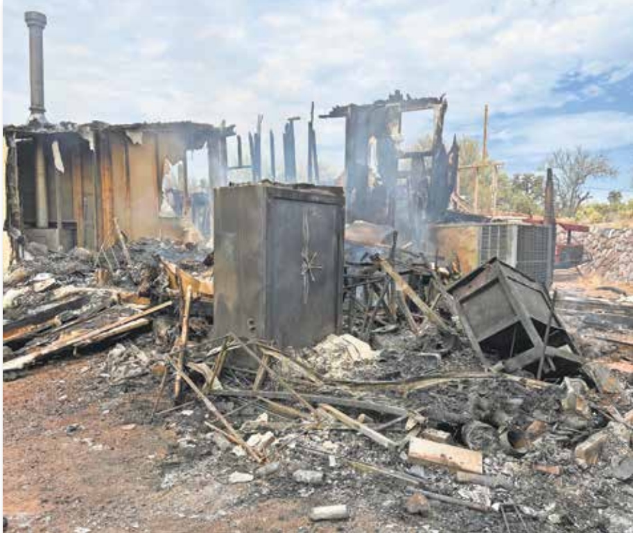
The home was declared a total loss after a structure fire in Mammoth.