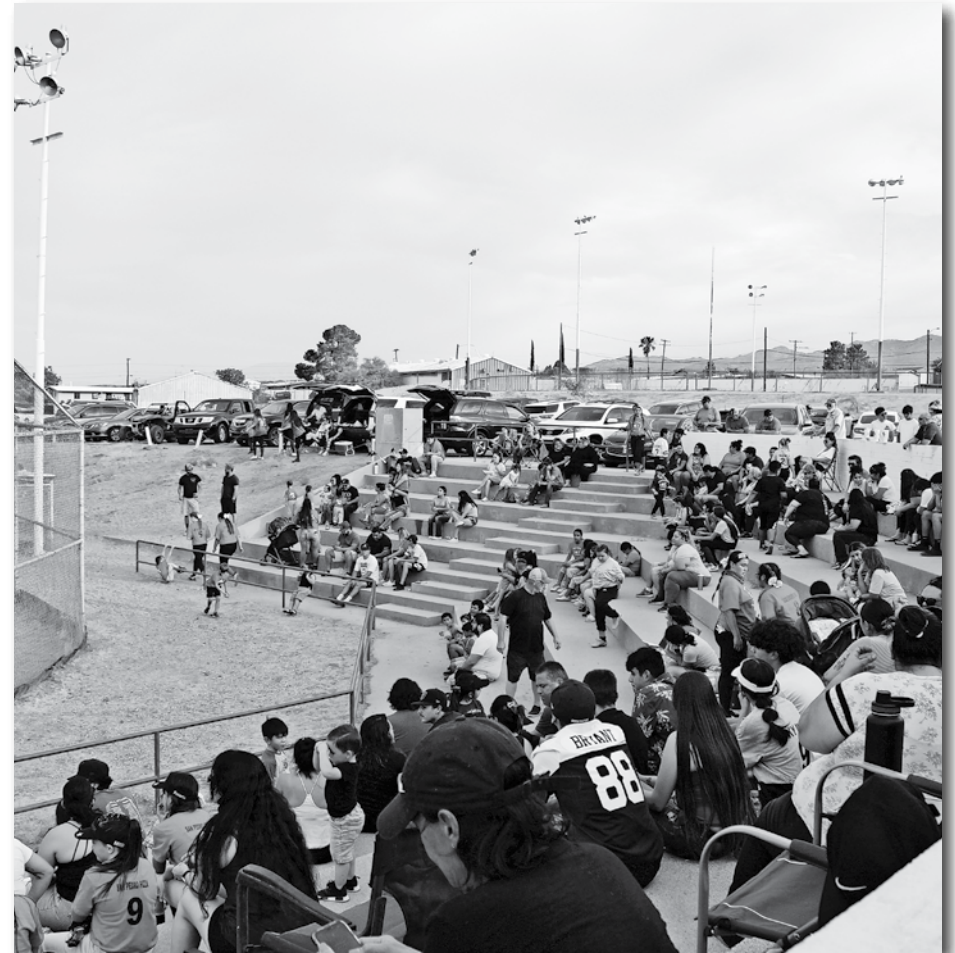
The stands were full of fans ready to cheer on their team at the opening of the Summer Softball League.

Sponsors of this season's Summer Softball League include 7 Sky Motel, Silver Mountain Mining, Oracle Ford, CheetoVibe Smoke Shop, Salt N Pepper, Downtown Hardware, SaddleBrooke Community Outreach and San Pedro Valley Pizza Co.