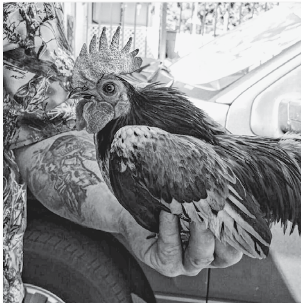
Little rooster off to a new home after being abandoned.