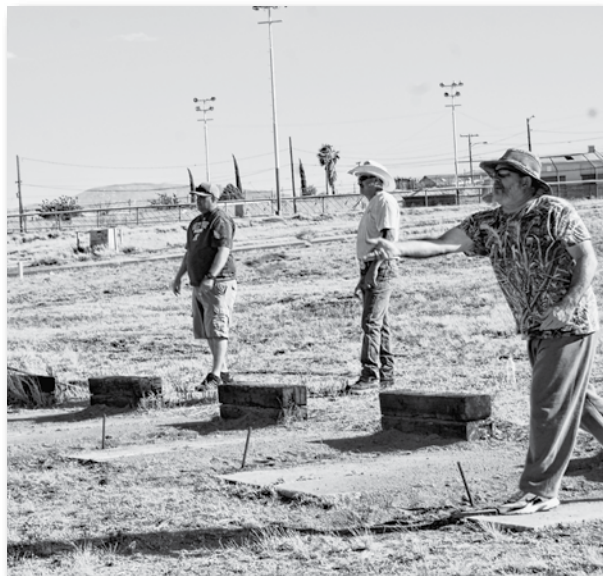
Lions Club will host a horseshoe tourney Saturday.