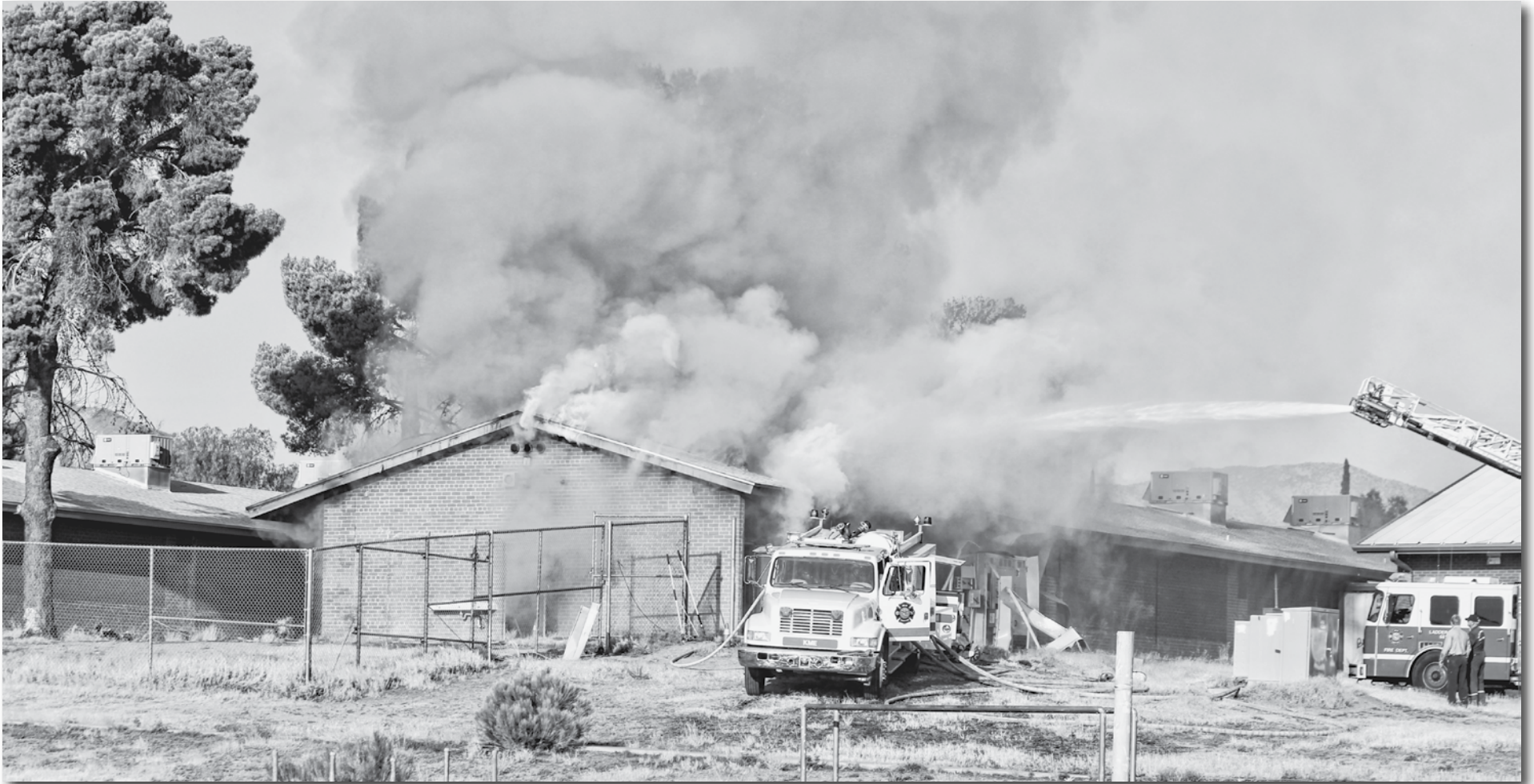
A four-alarm fire broke out at Avenue B Elementary School early Sunday morning. The roof at the east end of the north wing of classrooms was completely destroyed.