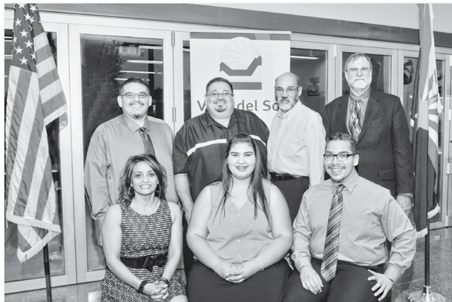
HLI Copper Corridor class of 2016.