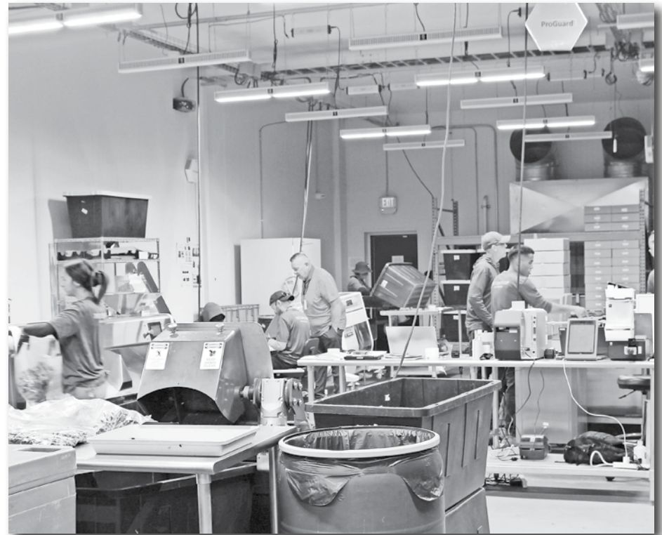
Flower Mine production room.