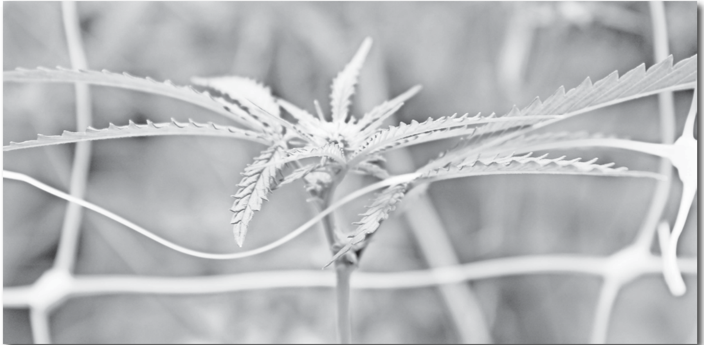
A close up of the plants grown at the Flower Mine in San Manuel.