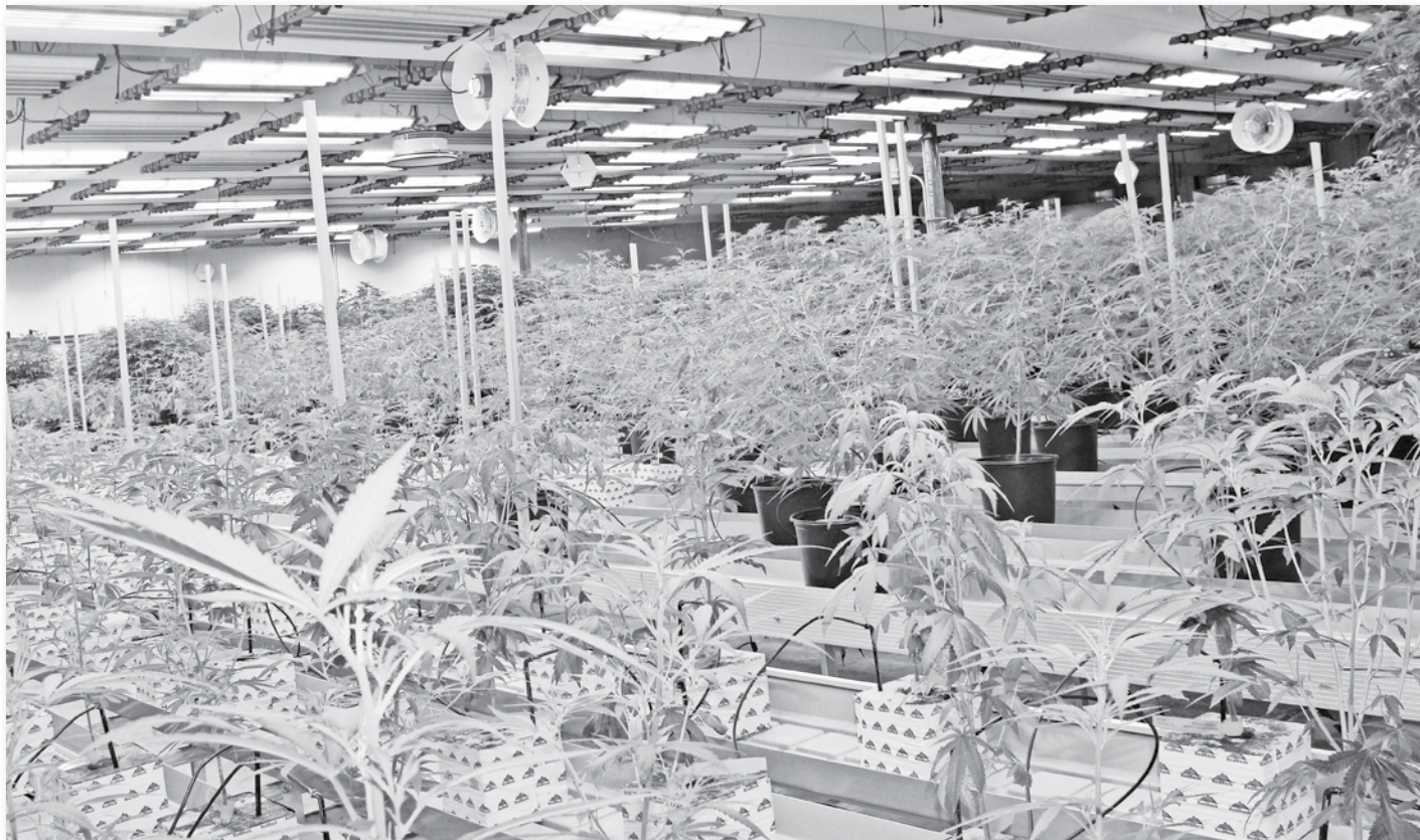
The Flower Mine in San Manuel boasts 100,000 square feet of growing space.