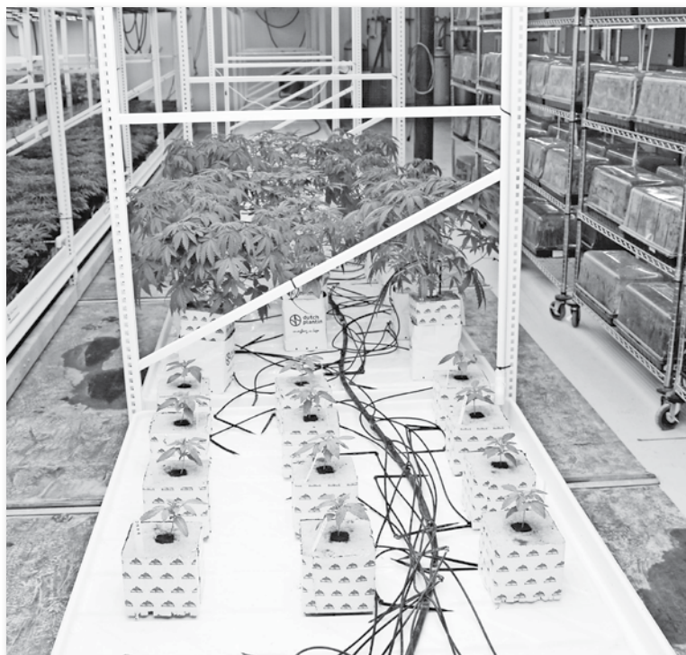
New plants are propagated at the Flower Mine in San Manuel.