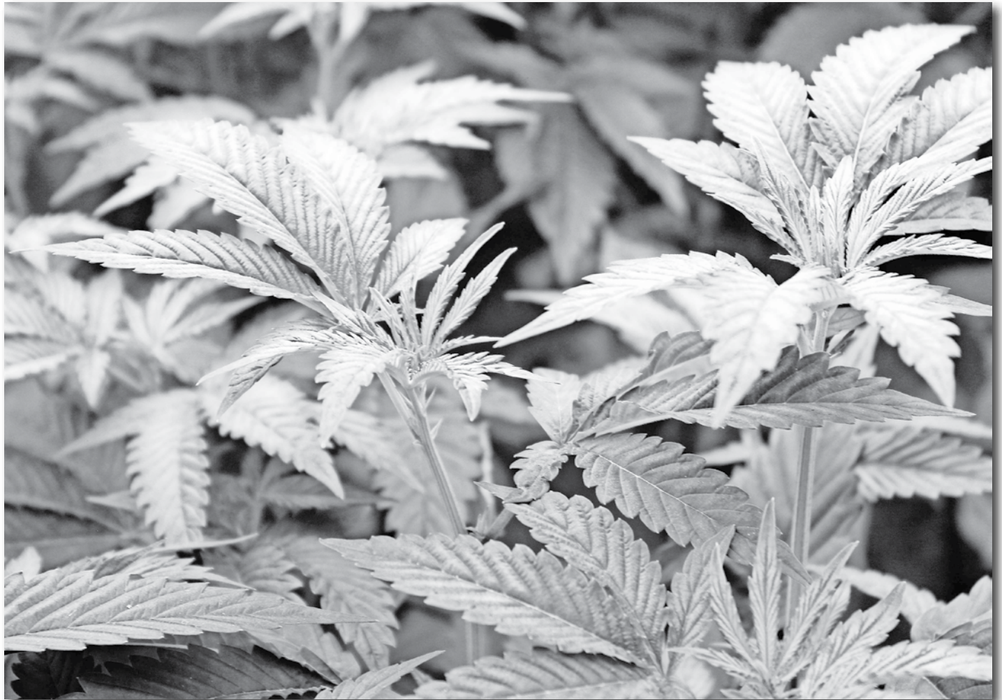
A close up of the plants grown at the Flower Mine in San Manuel.