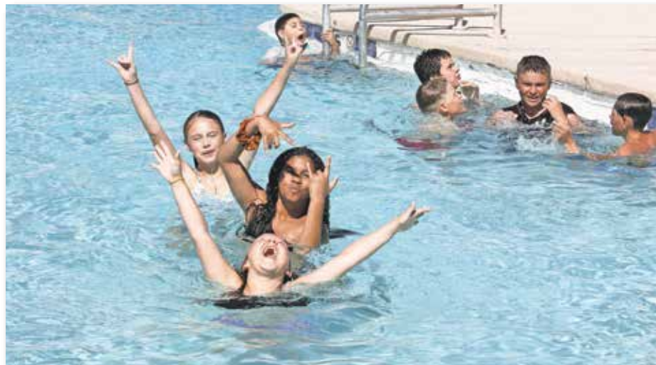
The Hayden and Kearny pools are open for the summer and kids of all ages are taking advantage and staying cool in the summer heat.