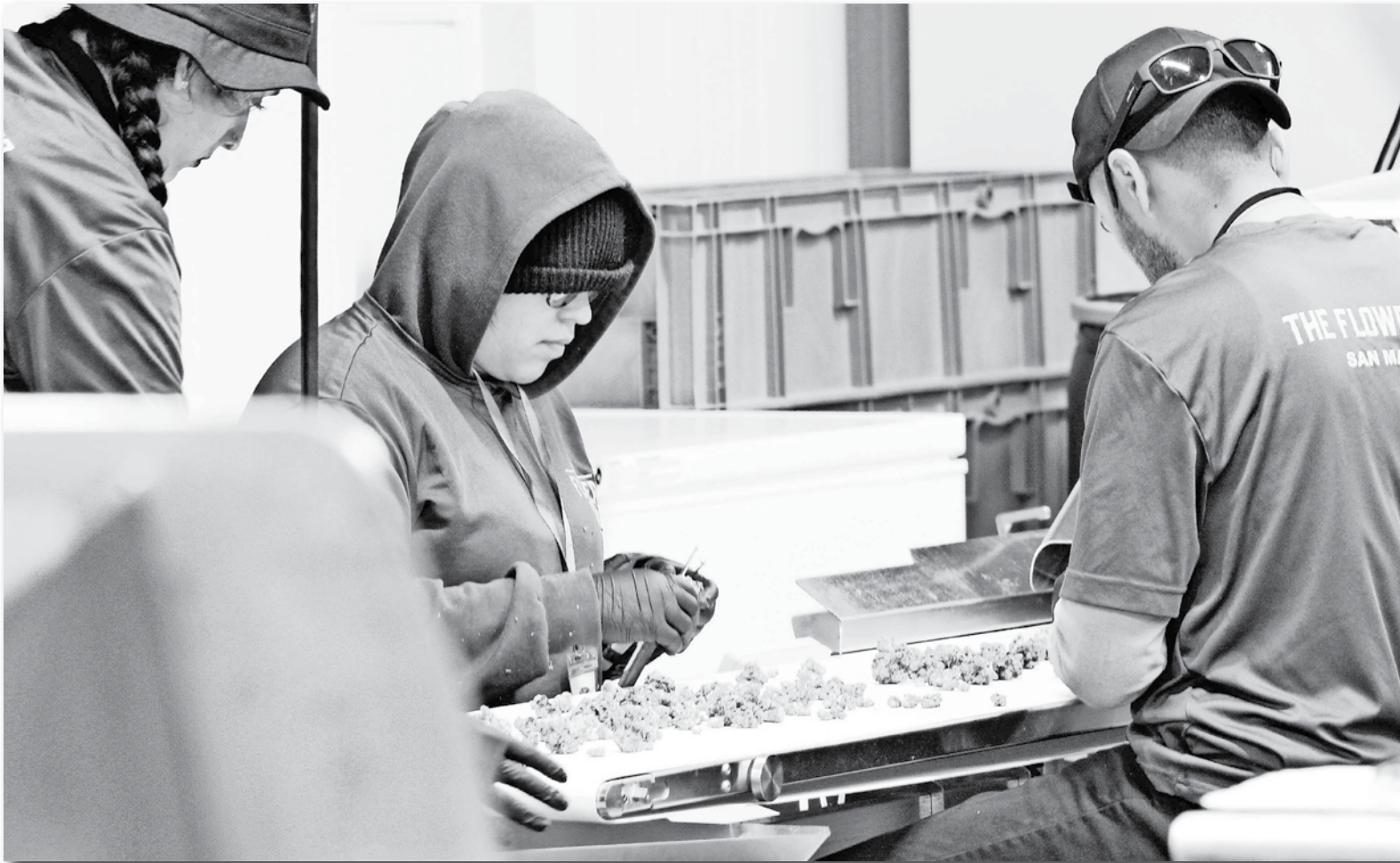
Employees of the Flower Mine in San Manuel package up the product for sale at their stores in the Phoenix area.