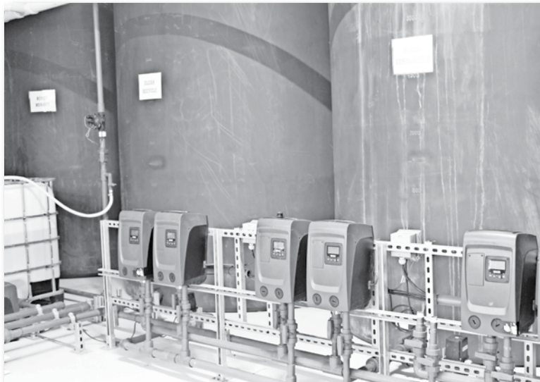
Part of the water recycling system at the Flower Mine in San Manuel.