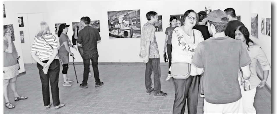
At the Pima College Art Show at Rancho Linda Vista.

These young and older students are a talented group. The Pima College Student Art Show will be on display until June 30, 2019.