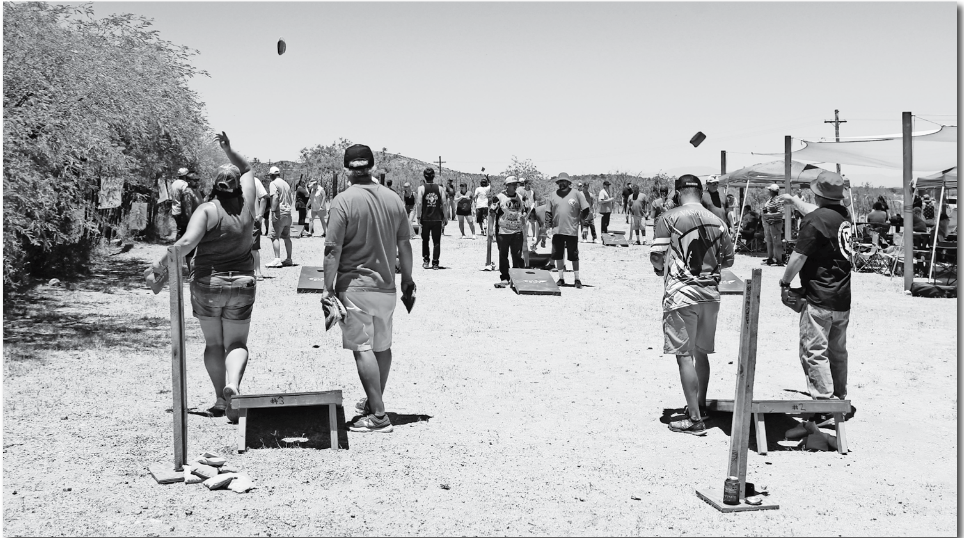
The bags flew Saturday at the Arizoa Zipline Adventures' Cornhole Extravaganza and barbecue.