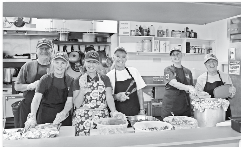
The Oracle Fire Department CERTs served lunch at the Oracle Community Center.

The Oracle Community Center is located at 685 E. American Ave., Oracle. Contact them by phone at 520-896-9326 or visit them online at www.oraclecommunitycenter.org .