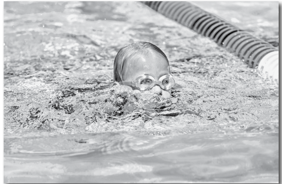
Kayla Lambiotte (5) swam the maximum number of events and won all of them!