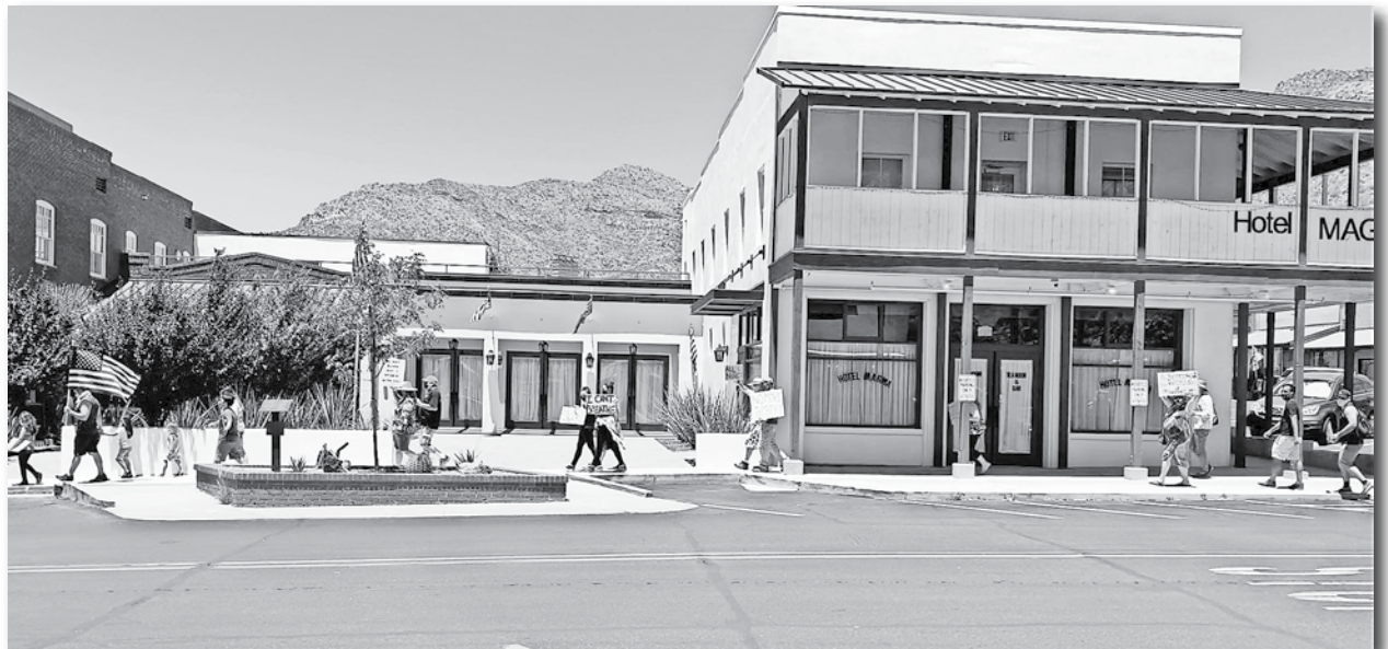
Peacefully marching, socially distancing, Superior CAN hosts COVID-19 appropriate walk for peace.