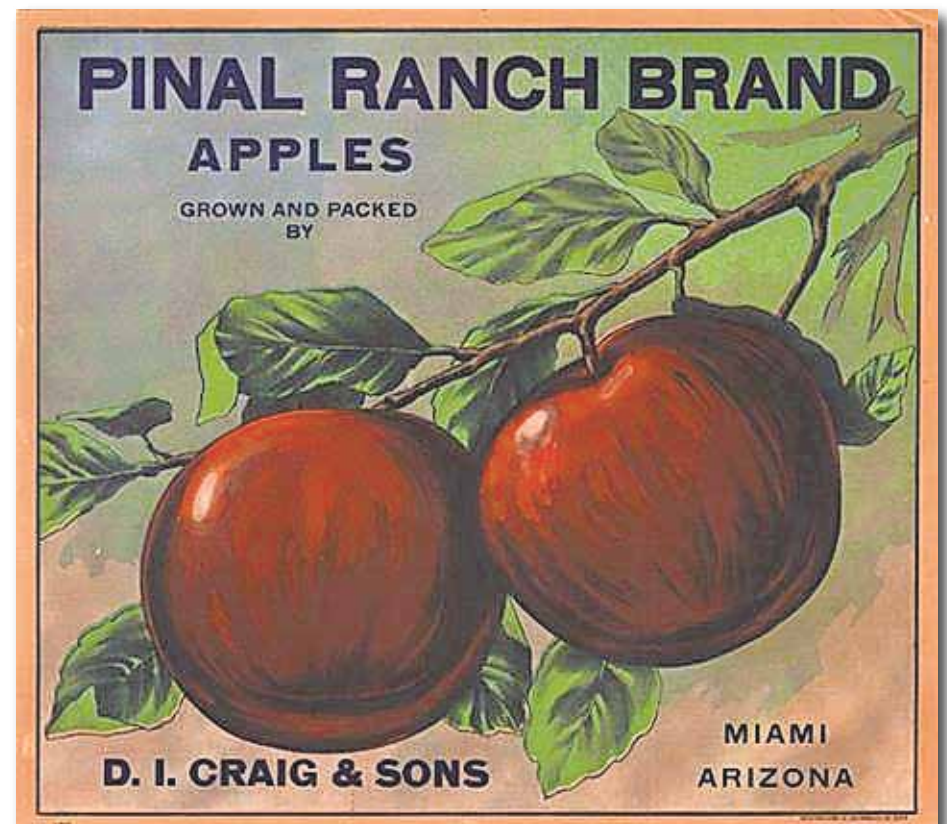
Crate label for Pinal Ranch apples.