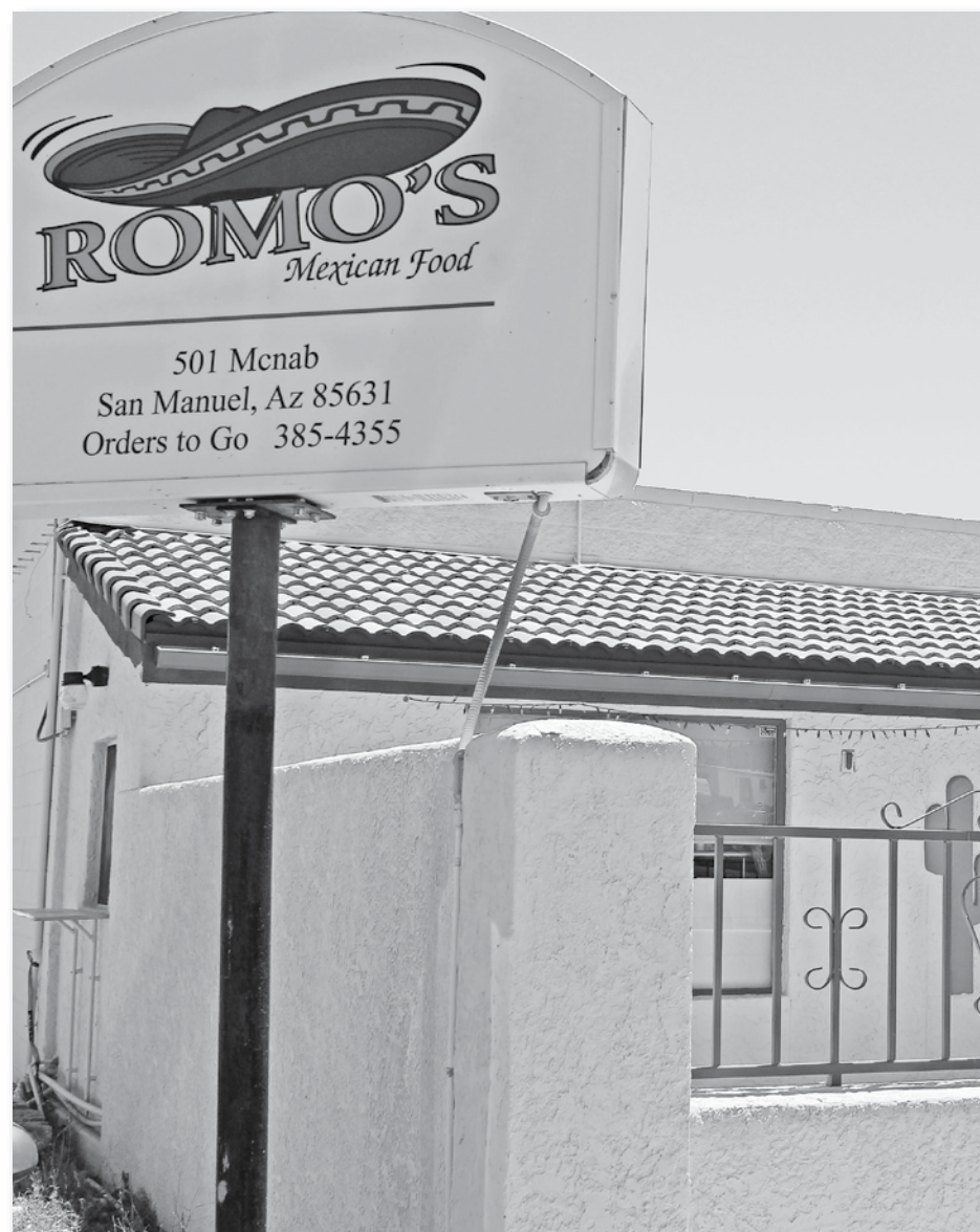
Romo's Mexican Food is open for inside dining as well as takeout.

Be sure to visit one of the restaurants listed above and show our local business owners support.