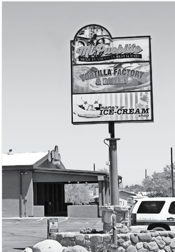
Mi Pueblitos in Mammoth is open for inside dining as well as takeout.