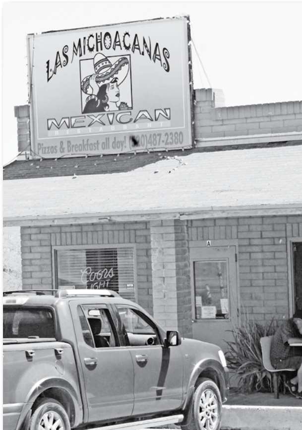
Las Michoacanas in Mammoth remains take-out only. No inside dining.

Securities offered through Woodbury Financial Services, Inc. member FINRA/SIPC. Investment advisory services offered through Arizona Financial Services. Woodbury Financial Services, Inc. is separately owned and other entities and/or marketing names, products or services referenced here are independent of Woodbury Financial Services, Inc.