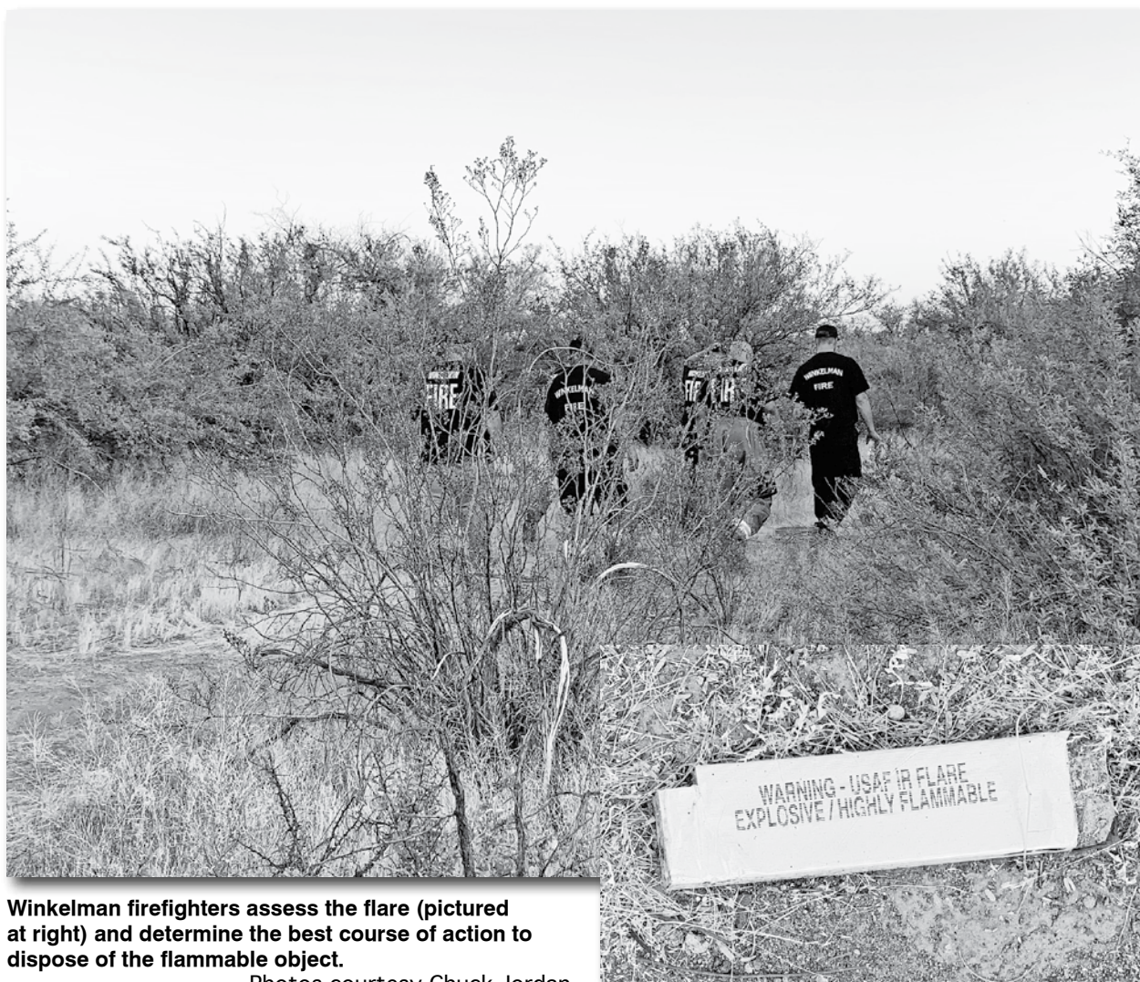
Winkelman firefighters assess the flare (pictured at right) and determine the best course of action to dispose of the flammable object.