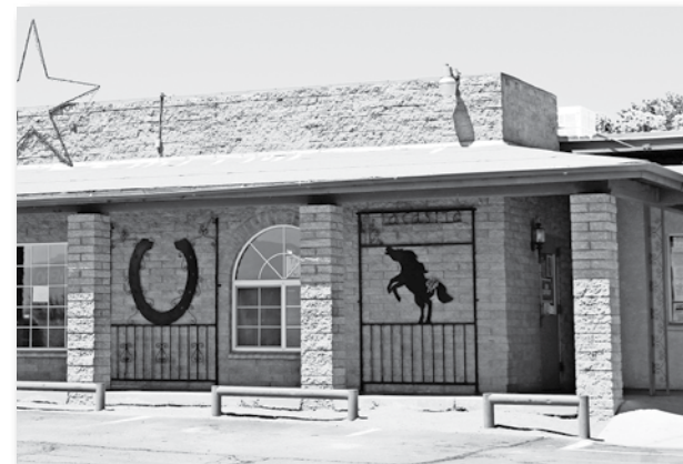
La Casita in Mammoth and San Manuel remains take-out only. No inside dining.