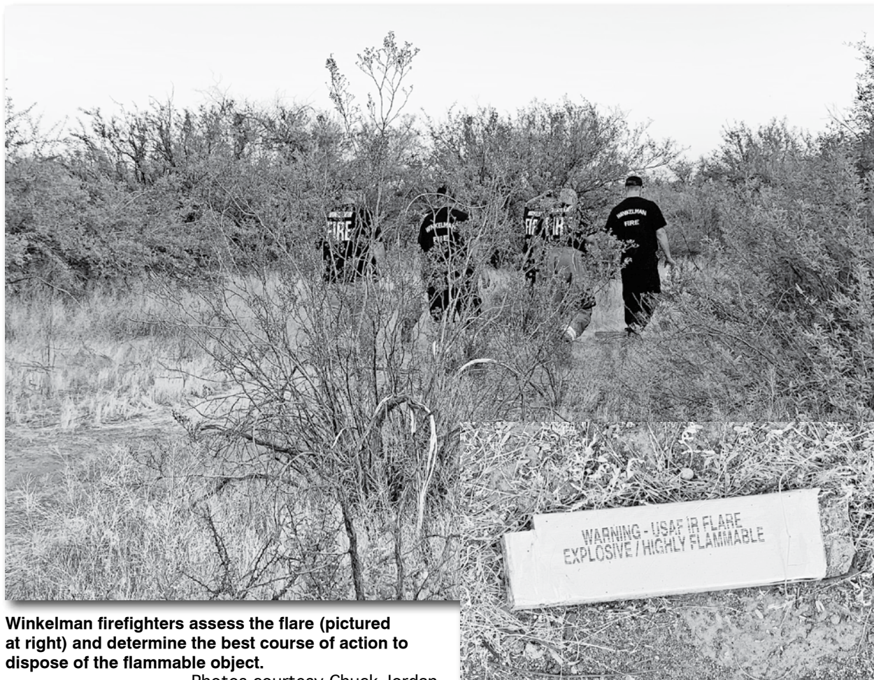
Winkelman firefighters assess the flare (pictured at right) and determine the best course of action to dispose of the flammable object.

Calls not listed include: traffic (31), suspicious activity (5), citizen assist (2), animal/cattle complaint (3), found property (4), ambulance request (14), fire call (3), agency assist (4), parking violation (1), extra patrol (1) and motorist assist (2).