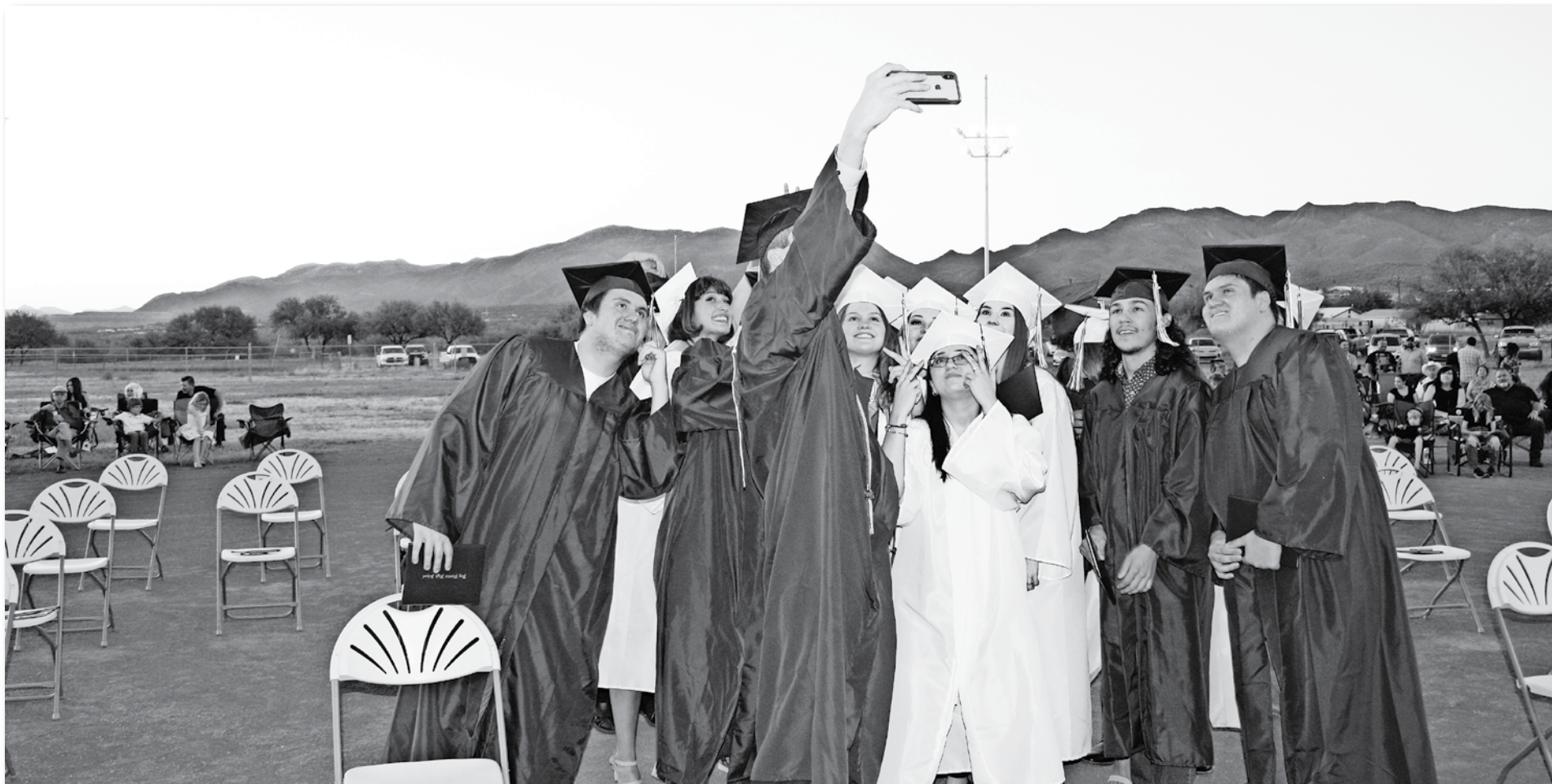
The Ray High School Class of 2020 takes its own picture.