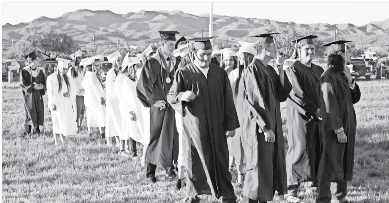
The class of 2020 are ready to received to receive their diplomas.