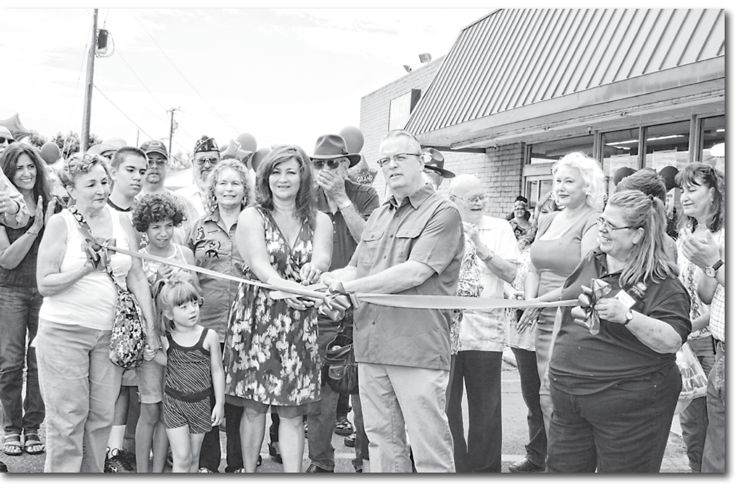
Cutting the ribbon.