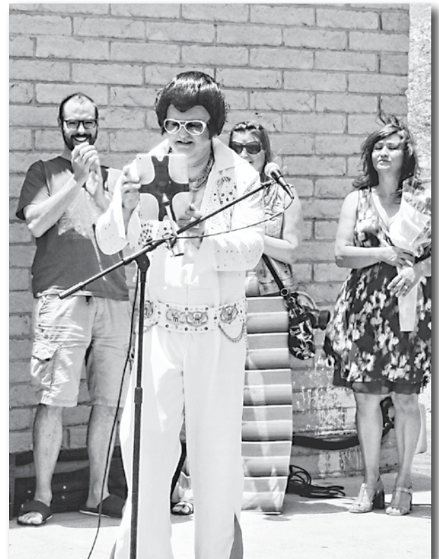
Elvis entertains the crowd.