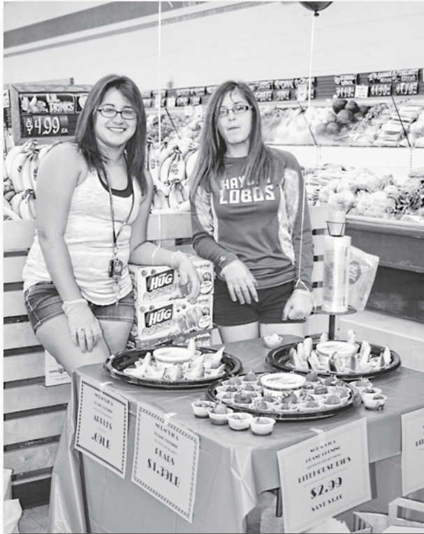
Young ladies from Hayden High School helped out inside the store with samples and demonstrations.