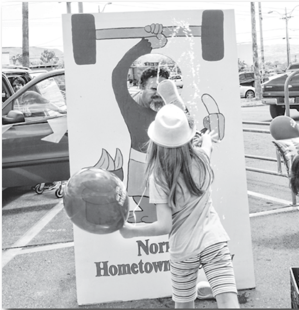
Taking a wet sponge to the face.