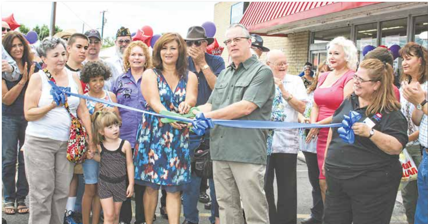
Cutting the ribbon.