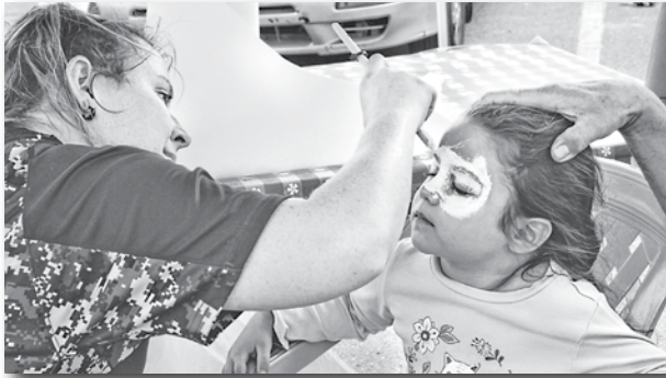
Facepainting for the kids.