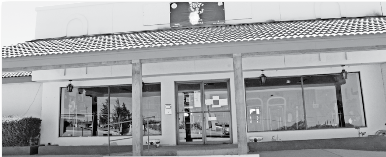
Waldo's Gym in Oracle.