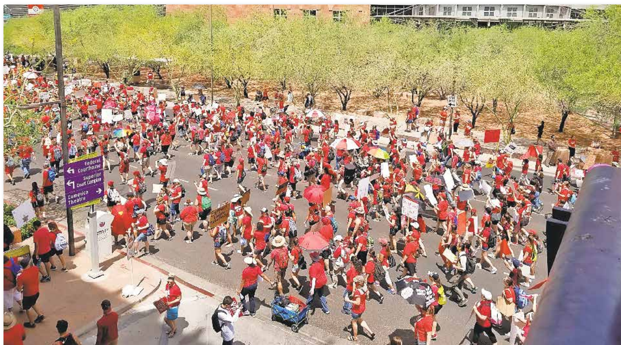
Copper Corridor teachers were among those who marched at the state capitol.