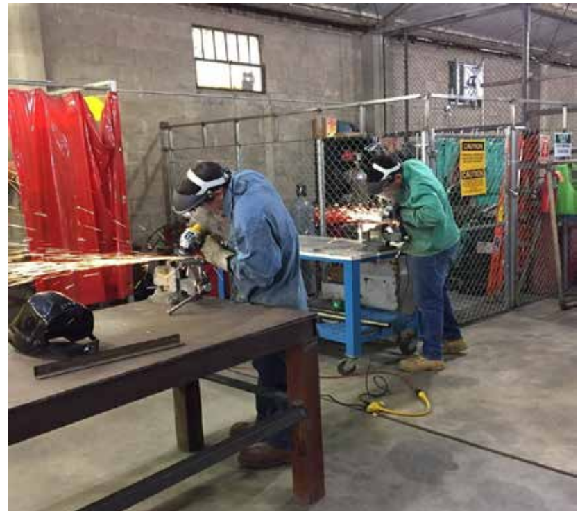
Students welding at Regional Training Center of Gila Community College.