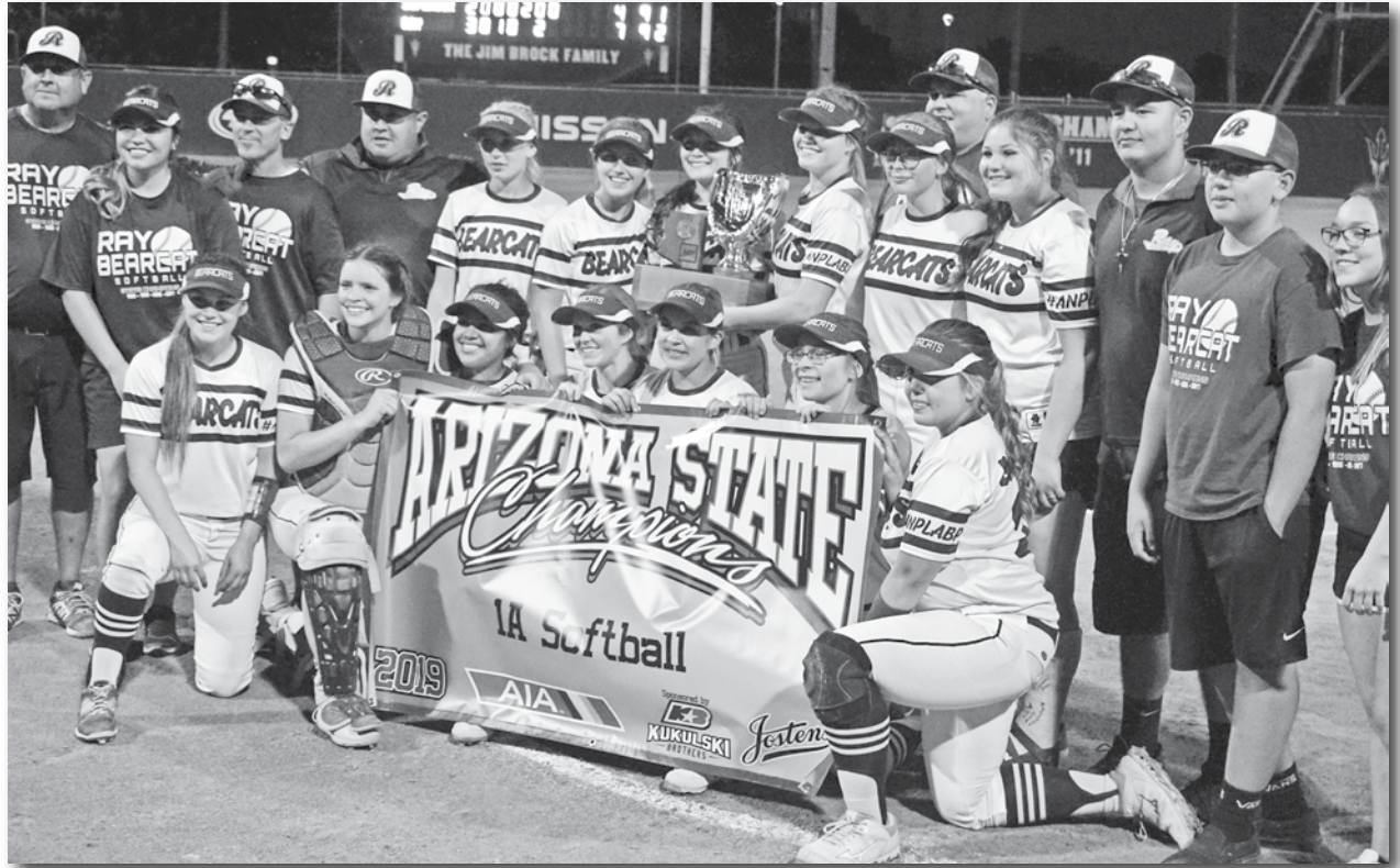
The 2019 Arizona State 1A Softball Champions: the Lady Bearcats.