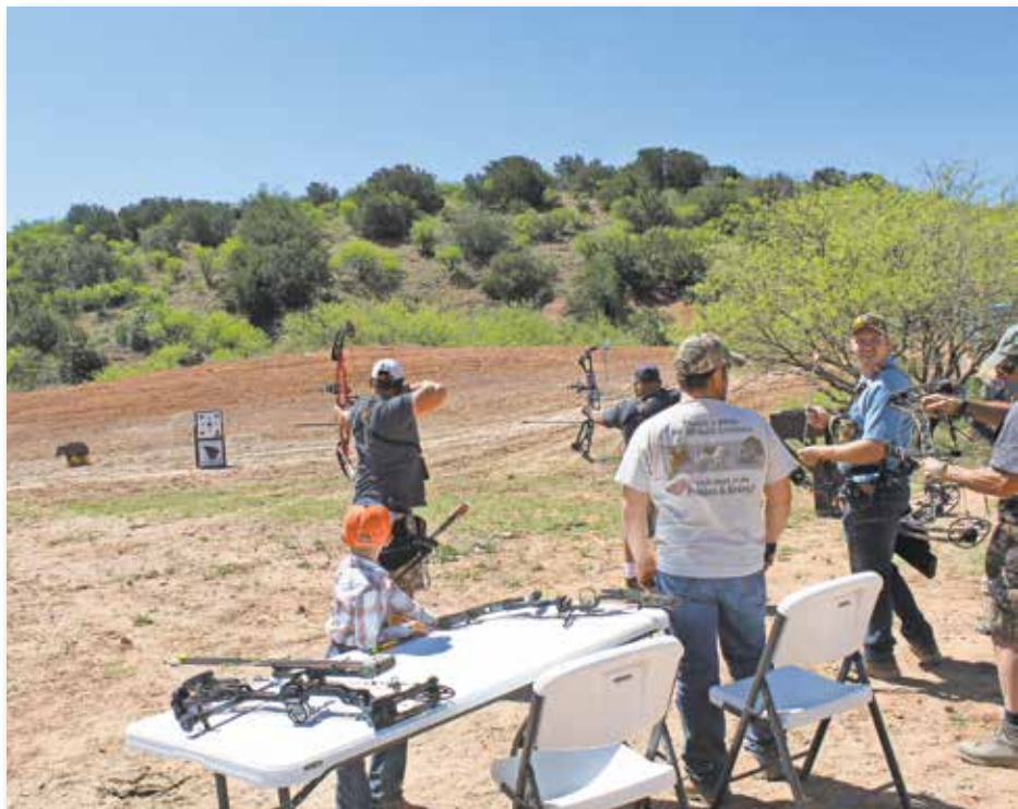
Local and out of town archers got a chance to try out the new archery range at the 3C Ranch.