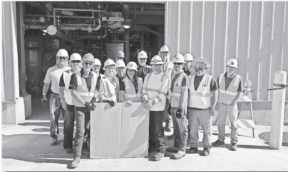
The staff at Florence Copper with the first cathode harvested in the in-situ mine.

pleased to have produced such high quality copper this early in the process. These results have exceeded our expectations. There is no better proof to demonstrate the success of our highly engineered in situ leaching process test facility. With the facility now at steady-state and producing high quality copper, we will use the balance of the year to refine and improve operating procedures for the commercial facility."