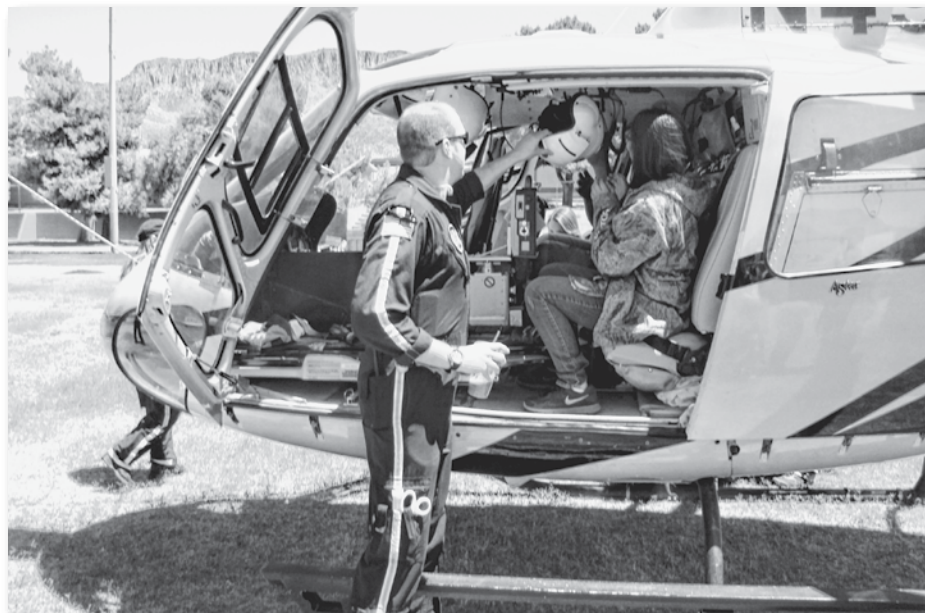
Superior students get up close on the Native Air helicopter.