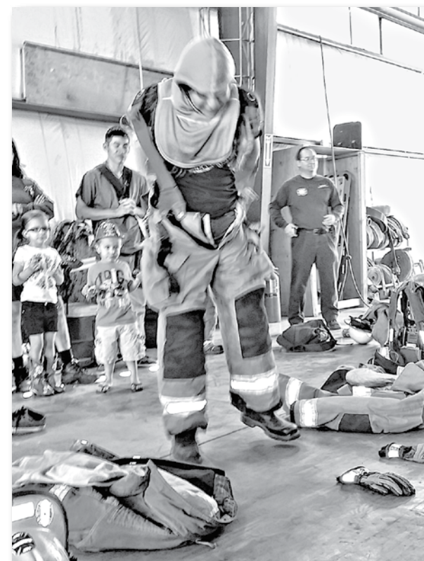
Even the girls tried out the firefighter turnout gear.