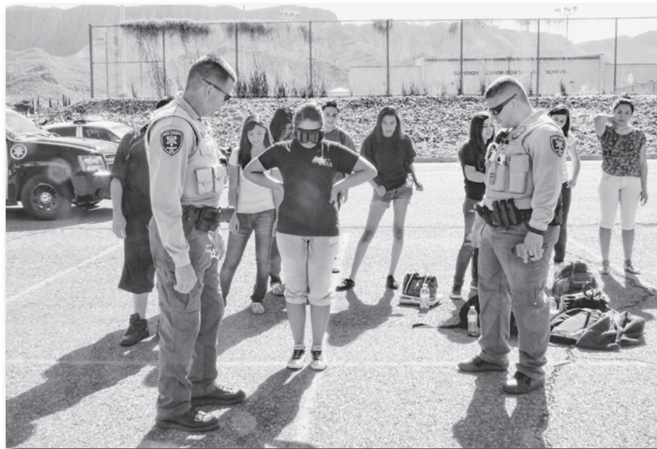
Superior students walk the line with the 'drunk goggles' on.