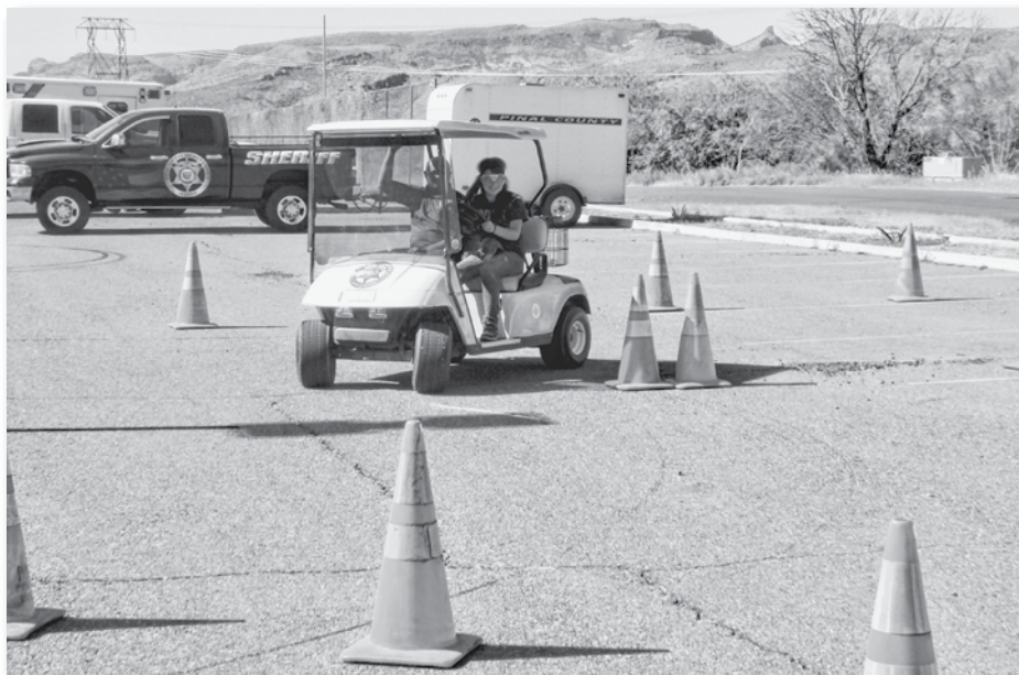
Superior students drive the course with the 'drunk goggles' on.