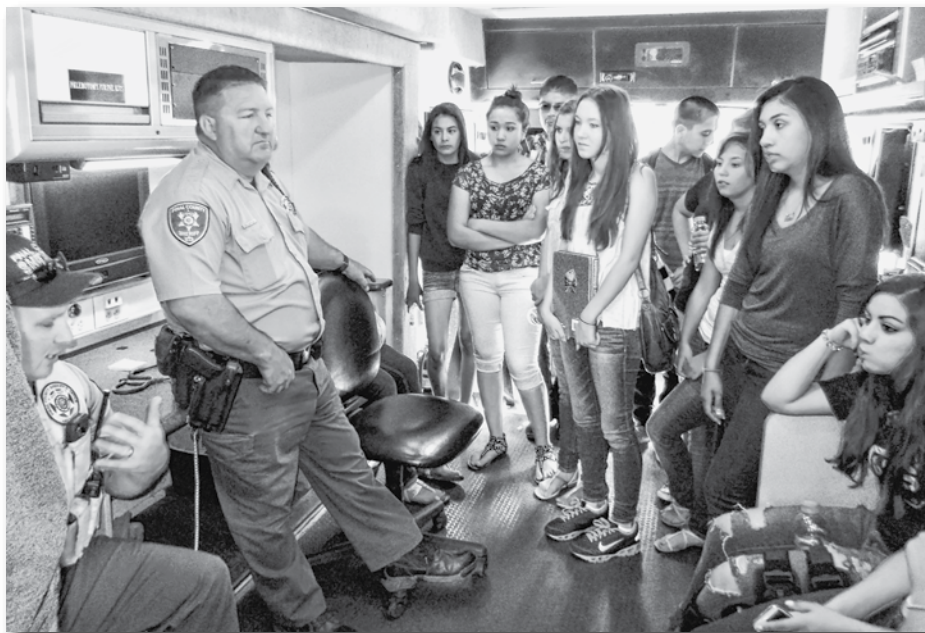
Inside the Pinal County Sheriff's Office mobile DUI command center.