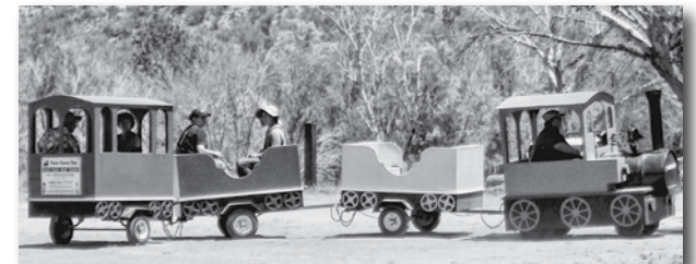
Desert Express Trains of San Tan Valley giving rides.