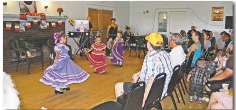
Baile Folklorico Alma de Superior.