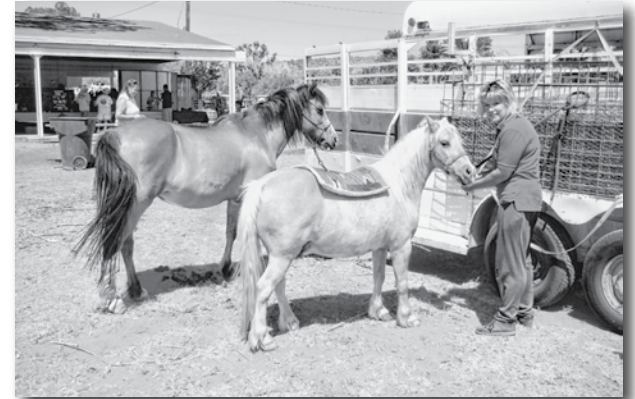
Getting the horses ready for riding. Kids were able to ride the miniature horses.