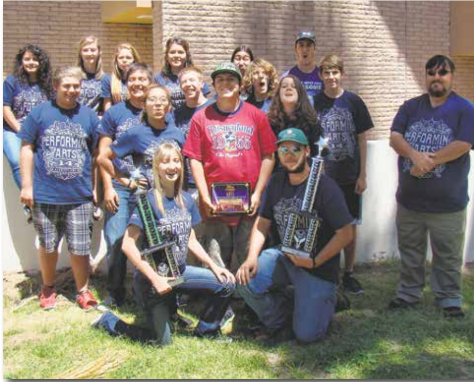
Members of the award-winning Ray High School band.