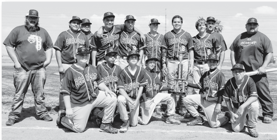
Ray Junior Bearcats