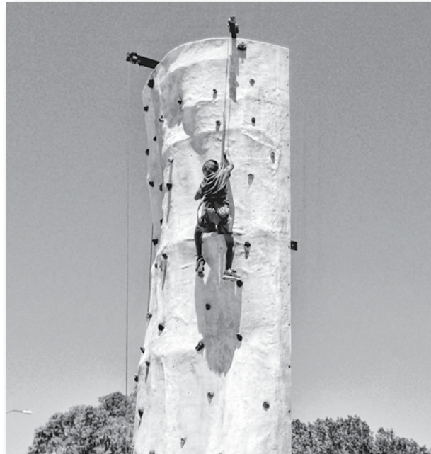
Youth having fun on the rock wall.