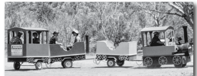
Desert Express Trains of San Tan Valley giving rides.