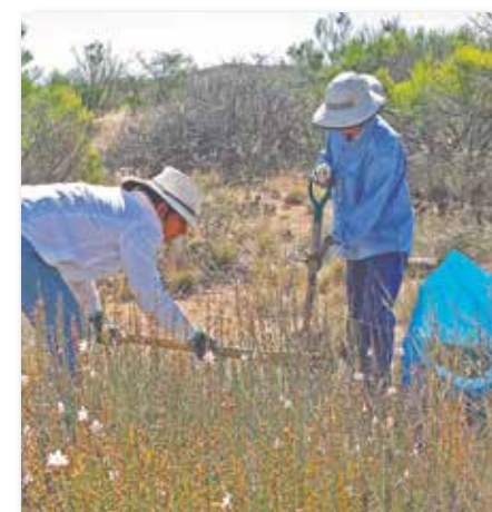
Volunteers work to remove onionweed.

Other examples of invasive weeds are the giant reed, bamboo, ( Arundo donax ) and buffelgrass ( Pennisetum ciliare syn. Cenchrus ciliaris ). Giant reed has created huge problems in waterways, such as Sabino Canyon and it can bring with it destructive