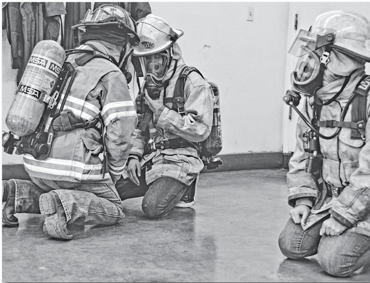
Students at Cobre Valley Institute of Technology study Fire Science at Gila Community College. Superior and Hayden-Winkelman School Districts are members of the CVIT JTED.

“Under the approved Education Budget, economics will once again necessitate closing programs that were brought back at the urging of business owners and parents alike.