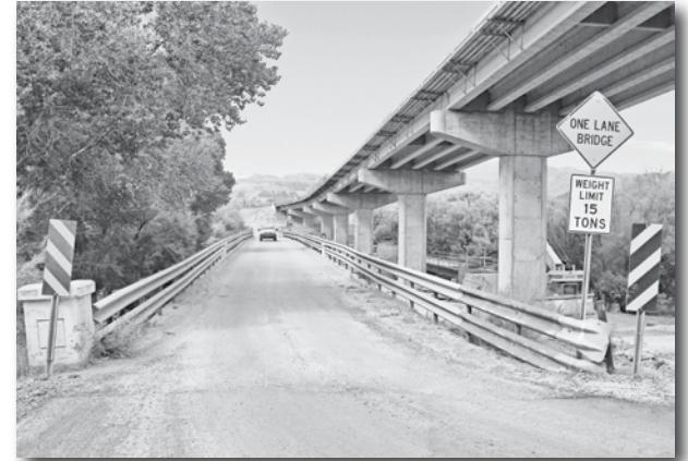
The historic bridge rests in the shadow of the new.

An archaeological survey completed in the end of 2007