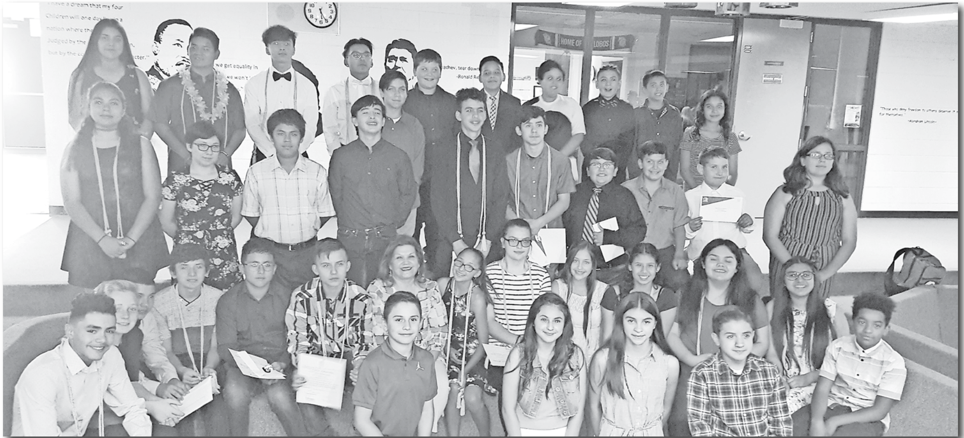
Hayden National Junior Honor Society and National Honor Society members were recognized earlier this month.