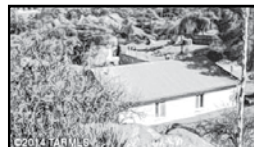
1950 E MT LEMMON HWY MLS#: 21408191

MOTIVATED SELLER! Immaculate home feels like new! Built in 2005, this home is in incredible condition. Inside, the scored-concrete floors welcome you to an open floor plan with great room and fireplace. The kitchen has beautiful granite counters and backsplashes. The master bedroom has its own private door to a full-length porch Large walk-in closet & lovely tiled master bath w/ two sinks and tiled shower. The formal dining room enjoys beautiful views to the east. Ceiling fans throughout. Both back & front areas have extensive rock walls. Enclosed back yard is secured and ready for pets, children, and your own special landscaping. 4500' elevation offers awesome year-round weather, spectacular mountain views & sunsets. $189,900