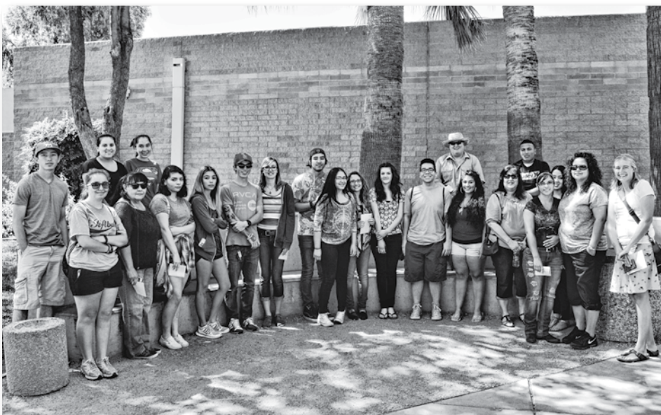
CAC Science Club at Reid Park Zoo.