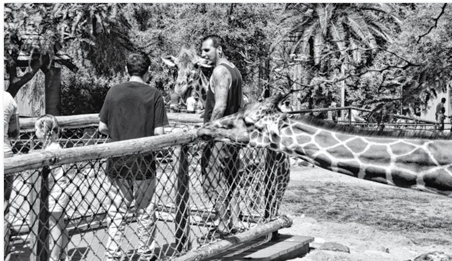
CAC students feeding the Giraffes.