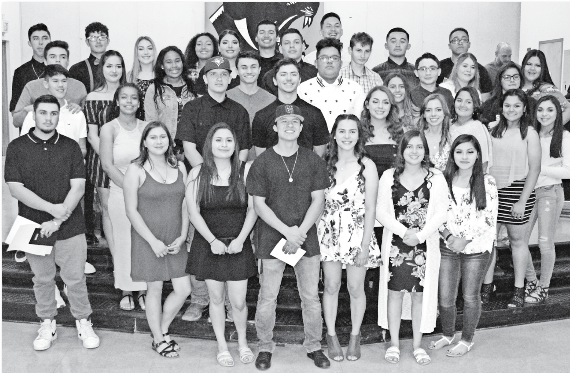
All the athletes honored at last week's Superior Athletic Banquet.