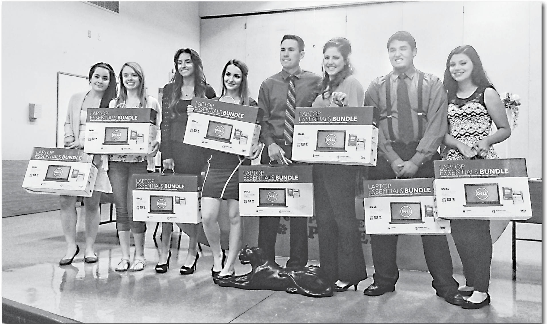
Superior Optimist Club and the Red Bears Outfitters presented students at Superior High School with laptop computers.