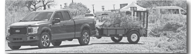
A truck and trailer loaded with brush.