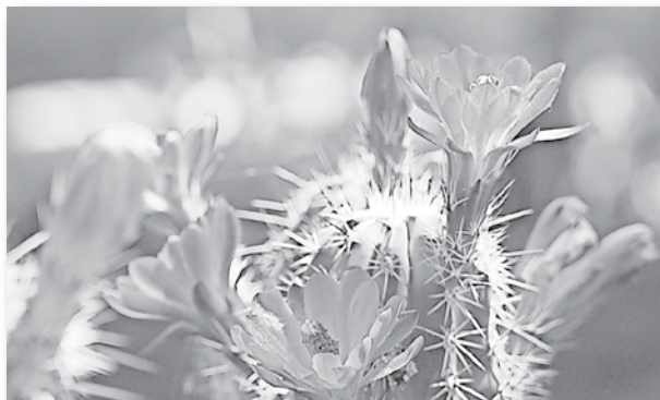
The Hedgehog Cacti is an endangered species.