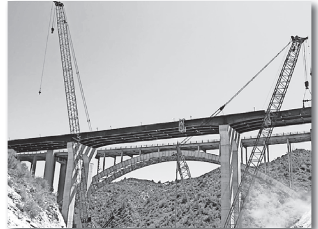
The Pinto Creek Bridge project between Superior and Globe goes right through the natural habitat for the endangered Hedgehog Cactus.

For more information on ADOT Environmental Planning: azdot.gov .