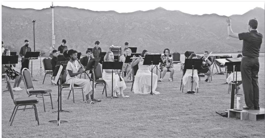
The fifth and sixth grade bands perform at the concert Thursday night at the football field.