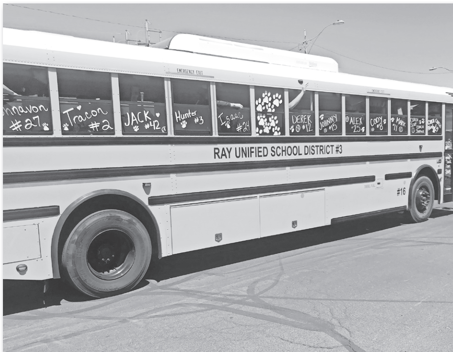
The Bearcats baseball team received a wonderful send off Saturday as they headed to play in the state tourney. Fans, friends and families cheered the boys as their bus departed the school.