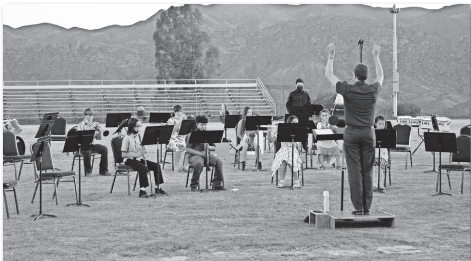
The 6th grade band performs at the concert.