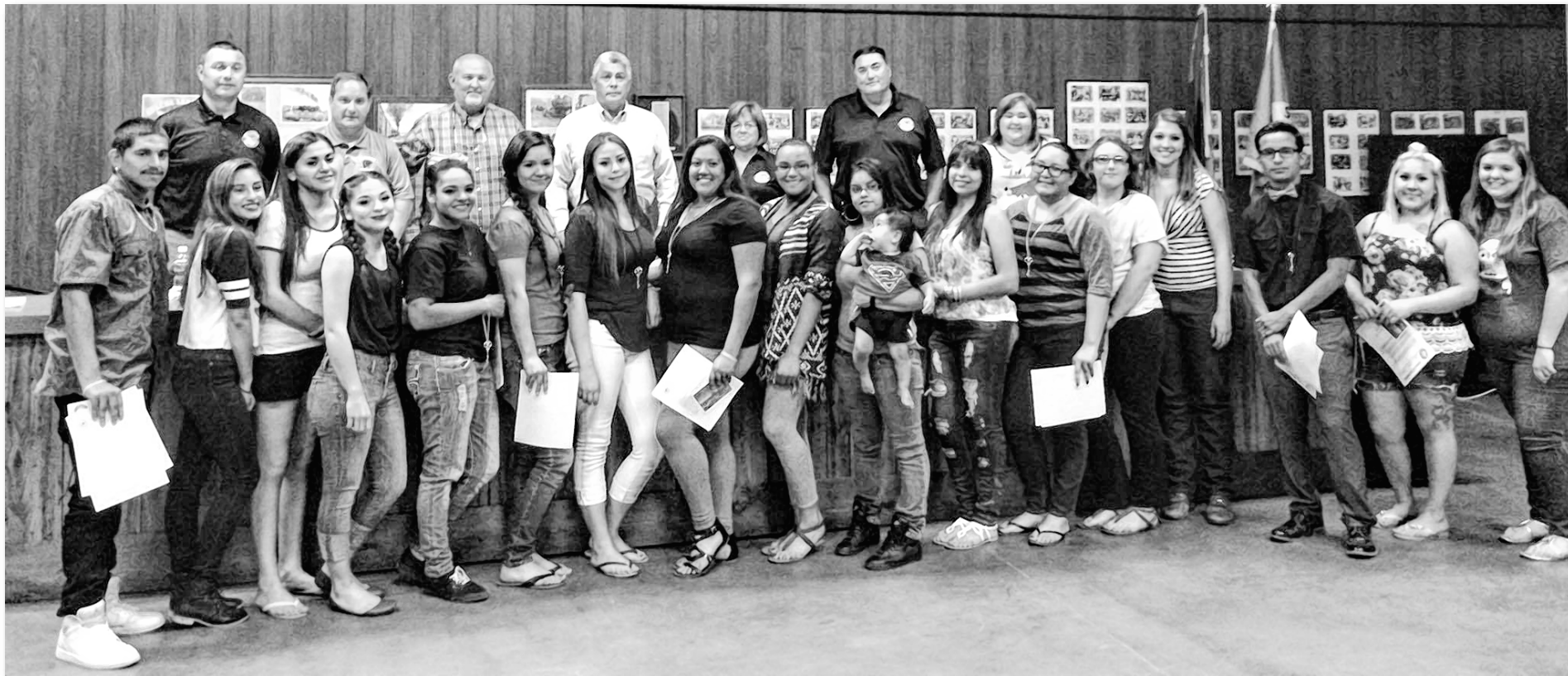
Graduating seniors from Superior High School were honored by the Superior Town Council last week.