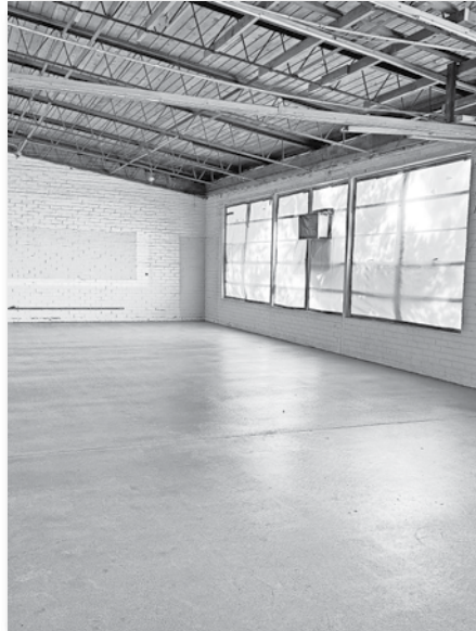
Some ‘before’ and ‘after’ photos of the rehab project at the Multi-Generational Center for the Town of Superior.