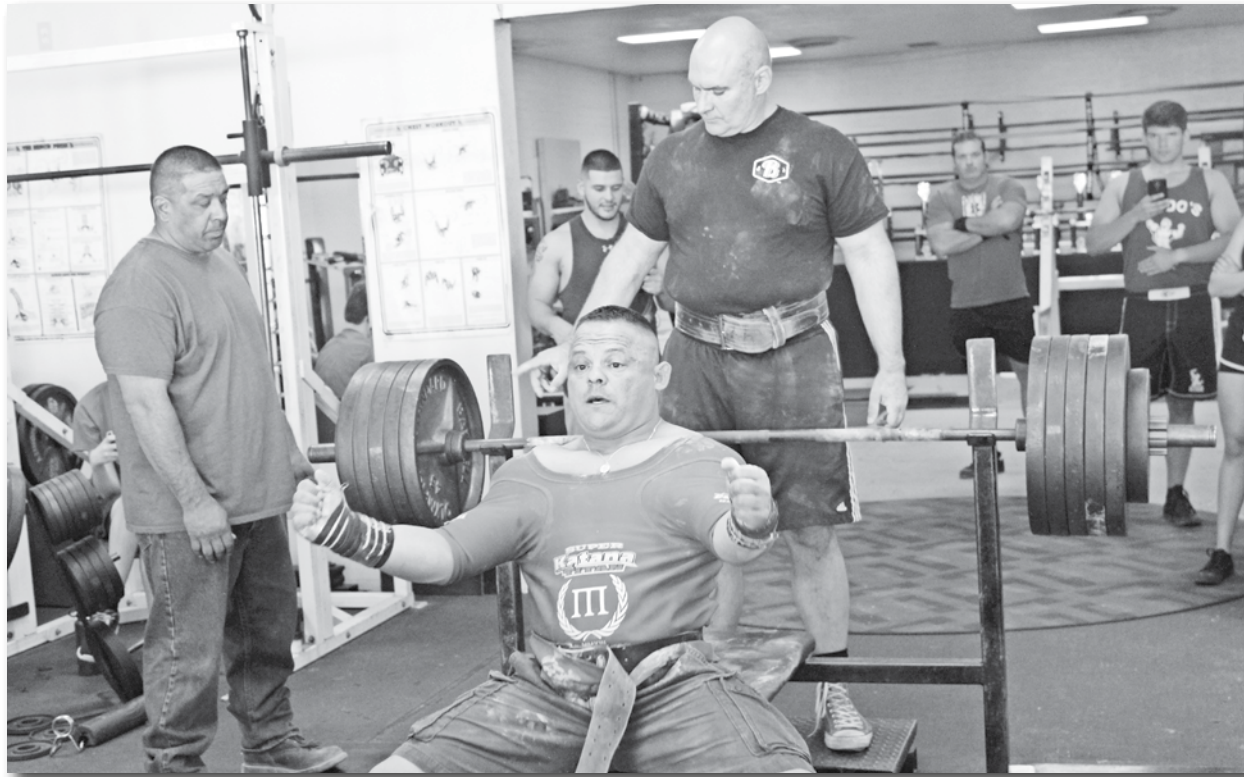
Working out at Waldo's Gym in Oracle.