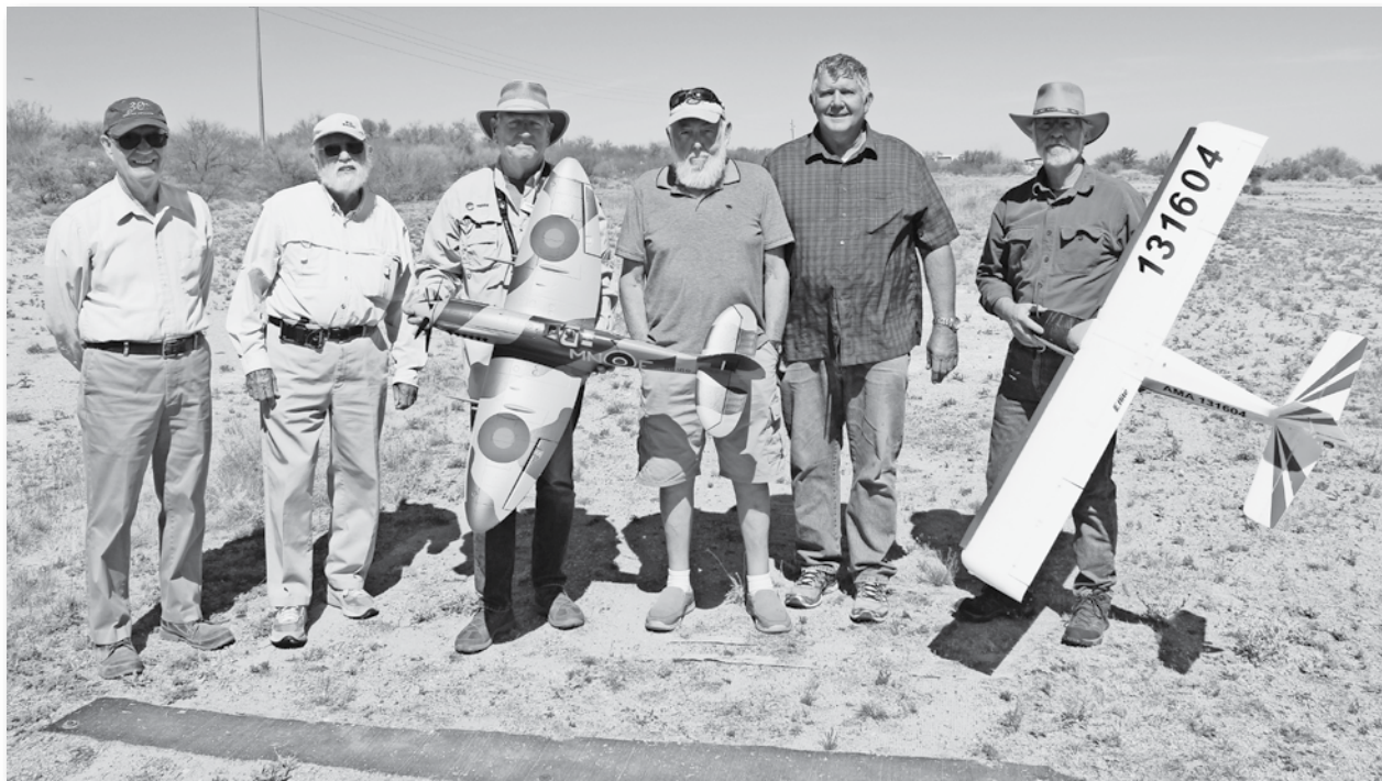
Tri-City Modelers at the club's airstrip in San Manuel.