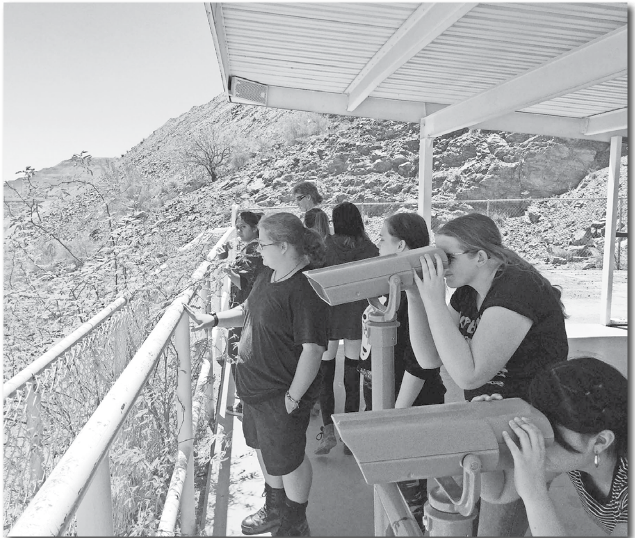
San Manuel's CTE construction class took a field trip to ASARCO to explore careers in copper mining.