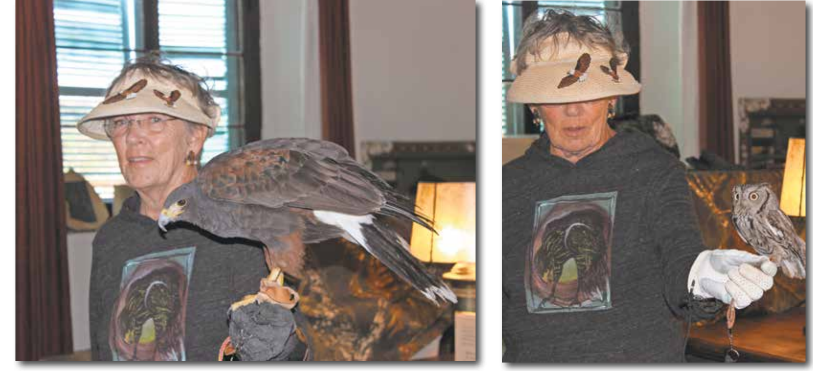
One of the last programs held at the Kannally Ranch House at Oracle State Park was a wildlife presentation with live birds. This event was held in early March before COVID-19 forced these events to be cancelled. The park remains open for hikers.

Hiking's not closed. Get out of the house. It's beautiful.