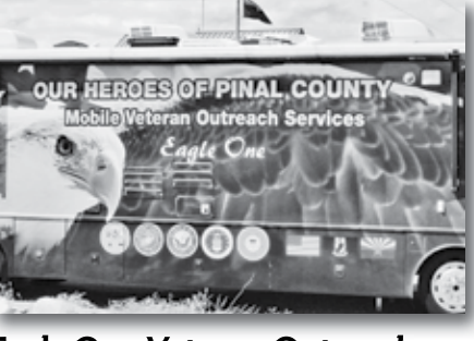
Eagle One Veteran Outreach

The Town of Kearny and RAD have announced a change of service for residential and commercial customers. Effective April 15 your new weekly trash and recycling day moving forward is Wednesday. Bulk services changed on March 1 to the second Thursday of each month and may be scheduled before noon on the day prior to your area pick-up date. Commercial services are every Wednesday, starting April 15. Please place both garbage and recycling carts out the night prior or by 6 a.m. on your service day. Allow 3 feet between each cart and 10 feet away from cars, mailboxes, landscape or other items that may interfere with service and 2 feet away from the building. Face cart so lid opens toward the street (handles toward building). Do not overfill or place additional garbage on top. Lids must be fully closed. This reduces airborne trash on windy days. Questions? Call Customer Service at 480-983-9100.