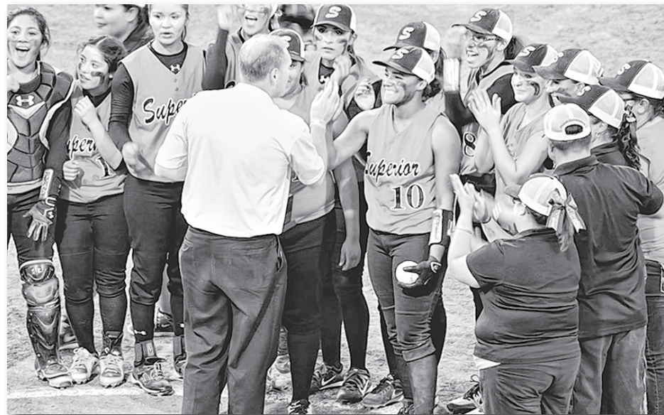
The Lady Panthers celebrate their win over San Manuel.