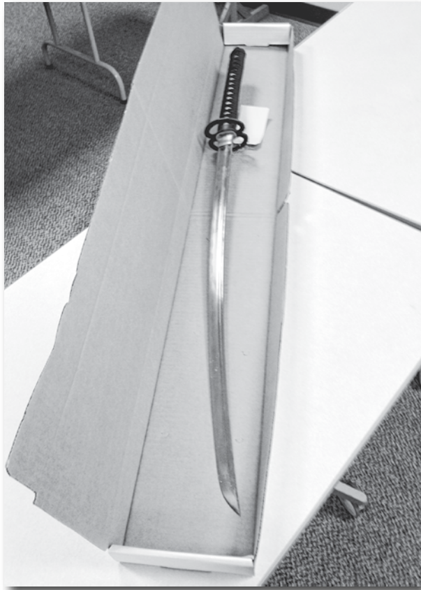
The Pinal County Sheriff's Office provided a photo of the Samurai-type sword used during an officer involved shooting in Kearny.

Pinal County Sheriff's Detectives are investigating an officer-involved shooting that proved fatal for a Kearny man.