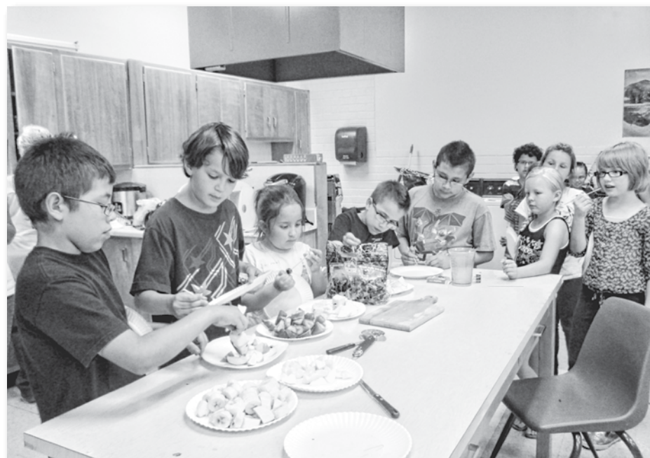
Family First is collaborating with San Manuel Community Schools with a Kids cooking class.