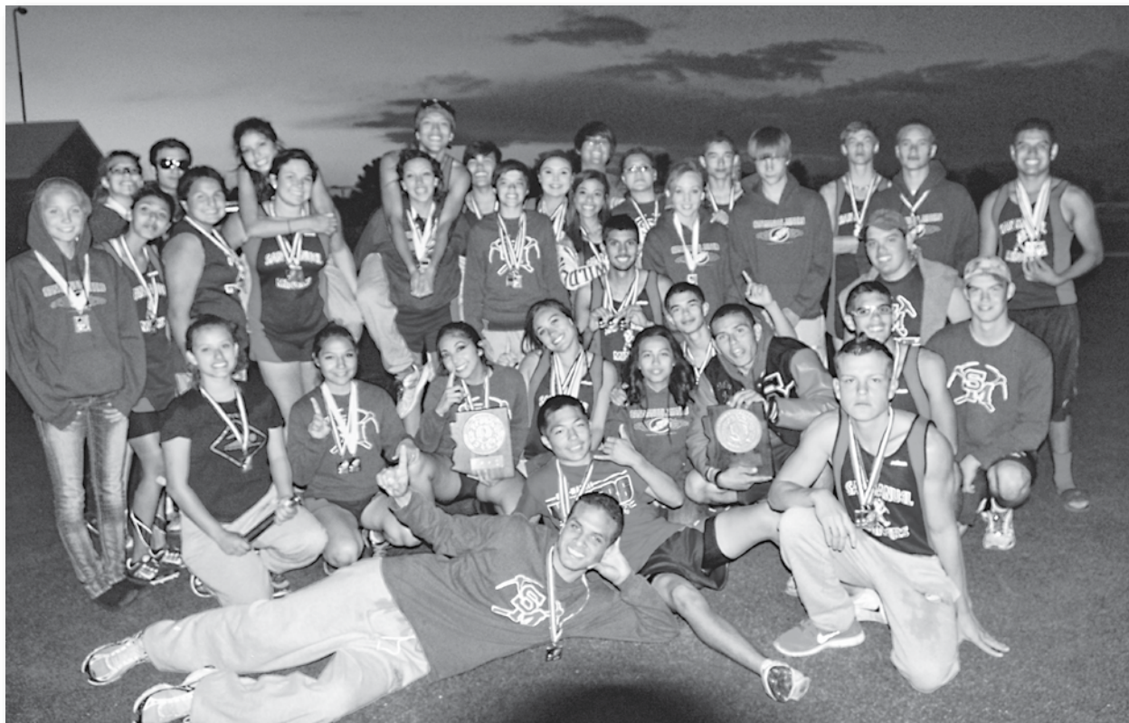
The Miner Track Teams were named Section Champions.