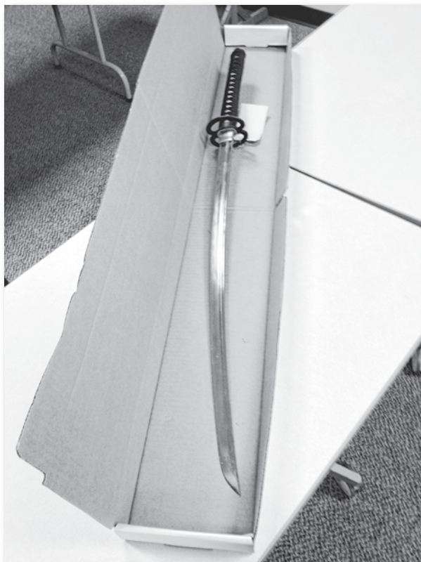
The Pinal County Sheriff's Office provided a photo of the Samurai-type sword used during an officer involved shooting in Kearny.

The case remains under investigation by PCSO detectives. PCSO Detectives are continuing with the investigation at this time.