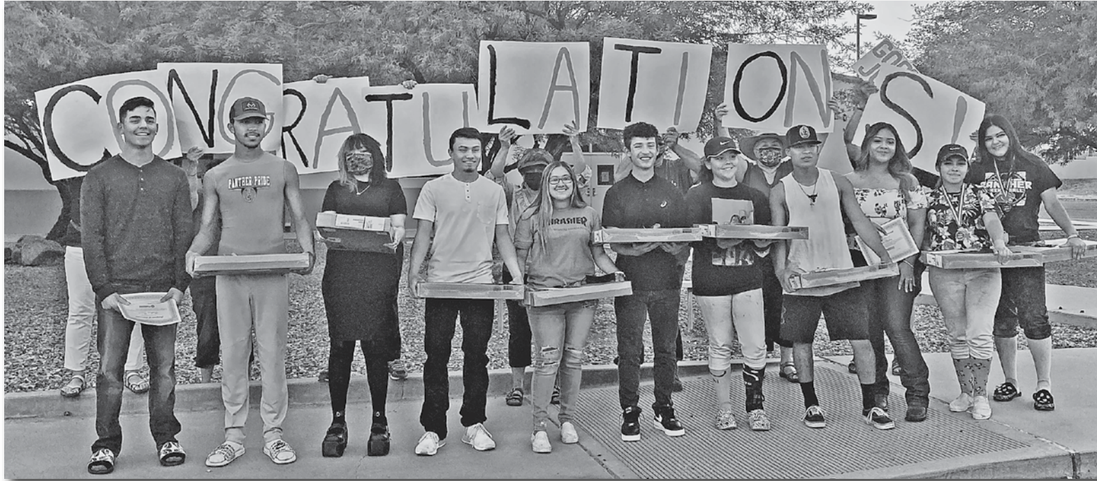
Pictured above are those students awarded with laptops by the Superior Optimist Club and Red Bear Outfitters.