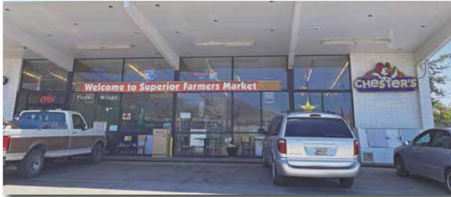
Superior Farmers Market is Superior's go-to place for yummy Chester's Fried Chicken. Mila Besich | Sun

In addition to the deli items, beverages and snack food, Superior's Farmers Market has a variety of smoking devices and other novelties and is a licensed dealer of Arizona Lottery tickets.