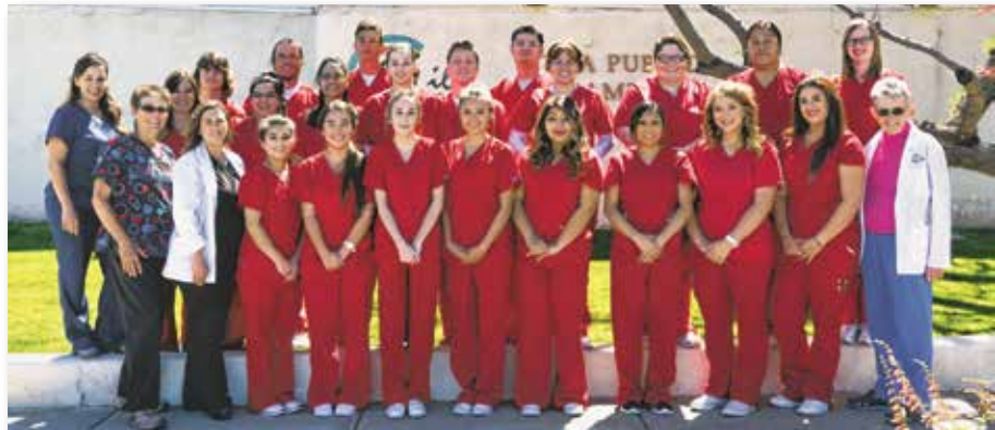
Spring 2016 GCC Gila Pueblo Campus Nursing Assistant students and instructors.

score a minimum of 75% on the written exam and 80% on the skills test to pass and become a Certified Nursing Assistant. The 2015 Arizona average first-time pass rate was 86% for the written exam and 76% for the skills test.