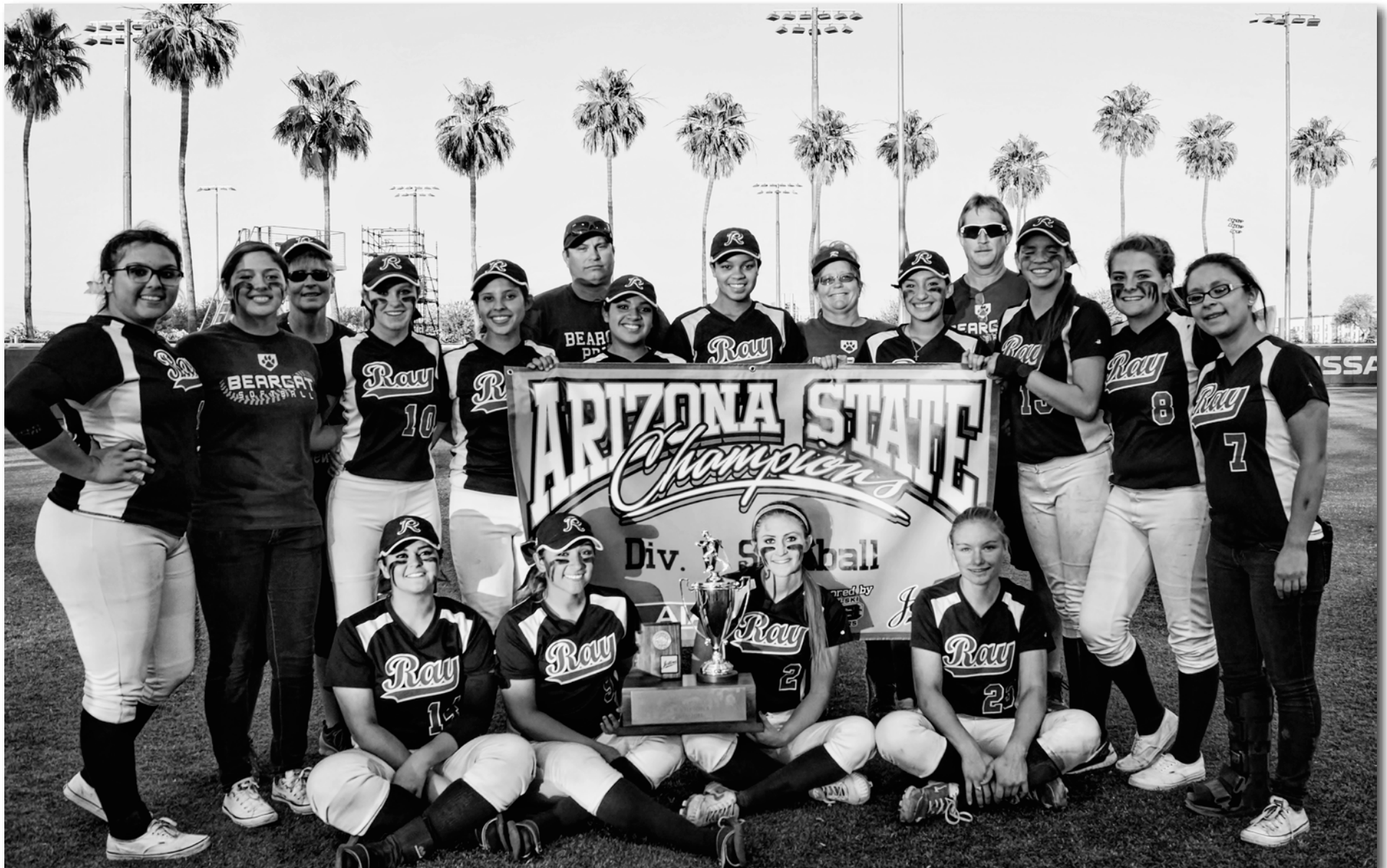
The Ray Lady Bearcats won the Division V State Championship on Monday night at Arizona State University.

Santa Cruz scored a pair of runs on three hits in the fourth to make it 7 – 4 and the Dust Devils had a chance