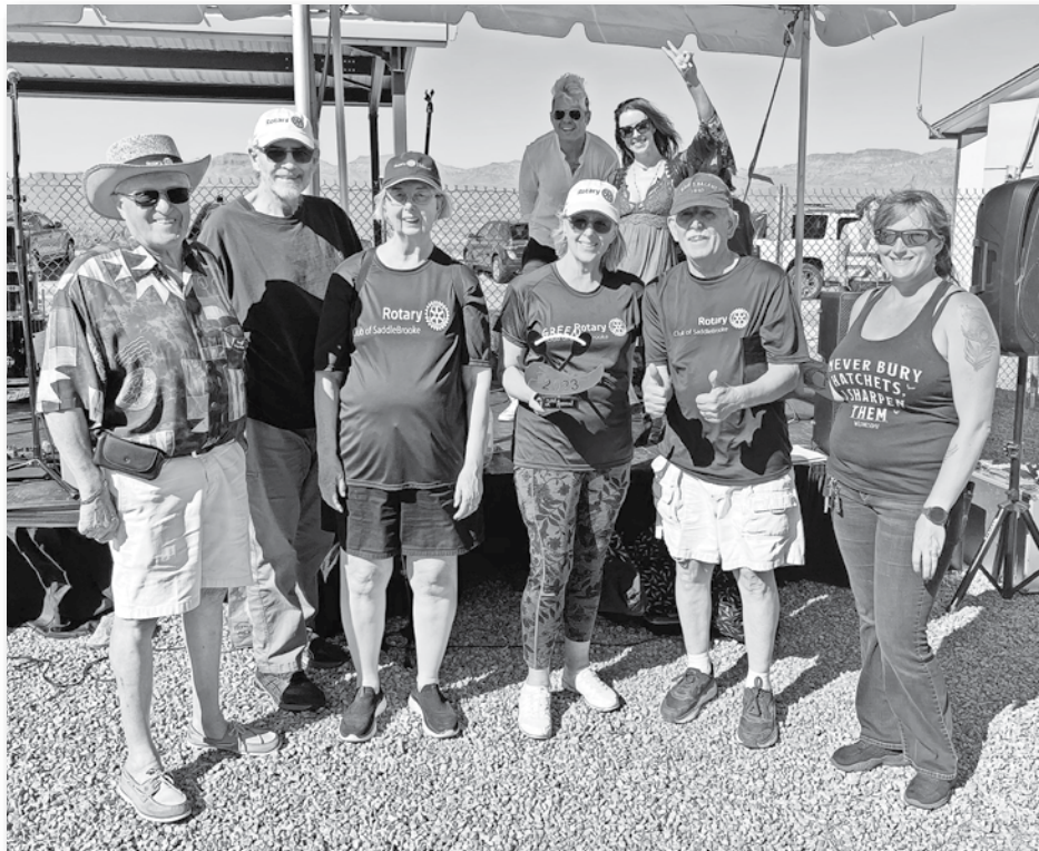
Green Chili Winners – The Rotary Club of SaddleBrooke.