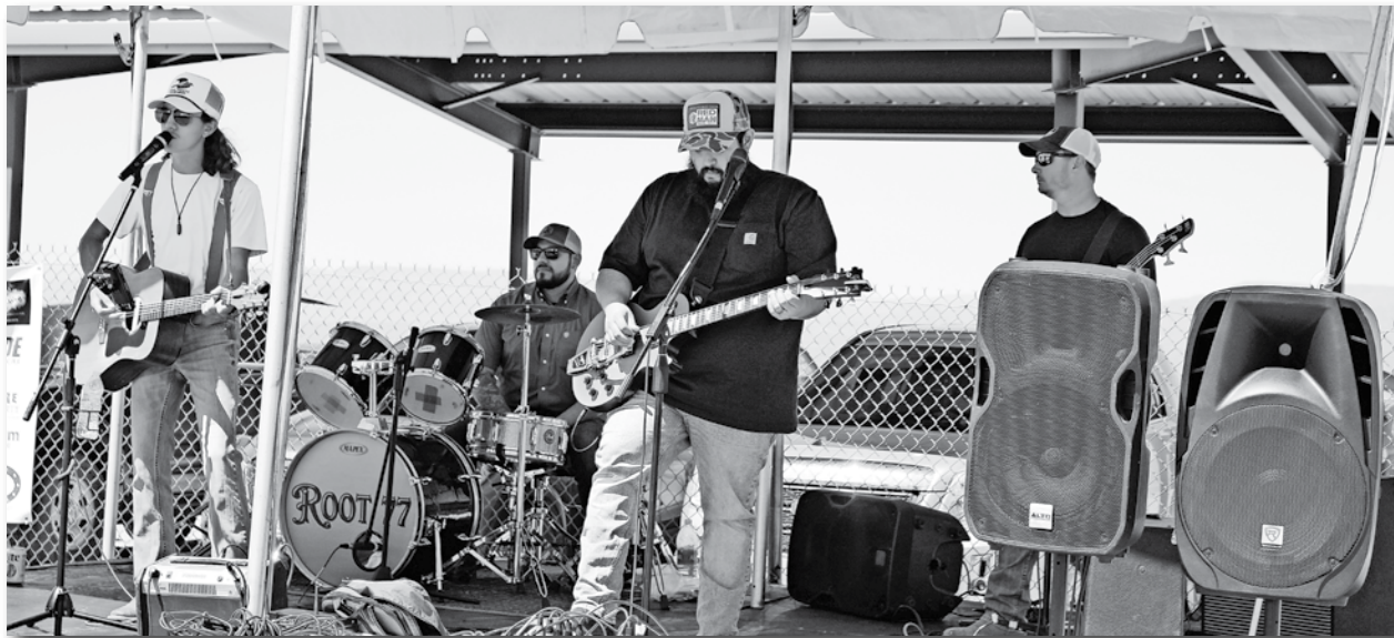
Root 77 entertains the crowd at the second annual San Manuel Chili Cookoff.

Seven chilis were entered into the cook-off this year. Claiming the win for the Red Chili division was Phat Flavors, San Manuel's rising new restaurant. The Rotary Club of SaddleBrooke took the trophy for the Green Chili division. Taking home the award for homestyle and the people's choice