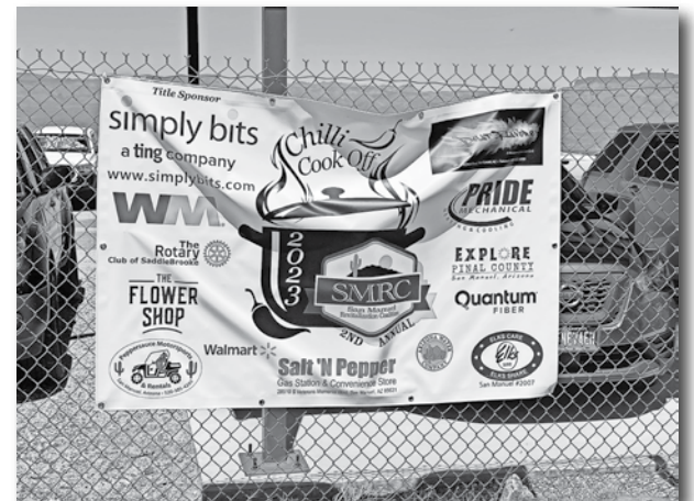
Sponsorship banner at the cookoff.