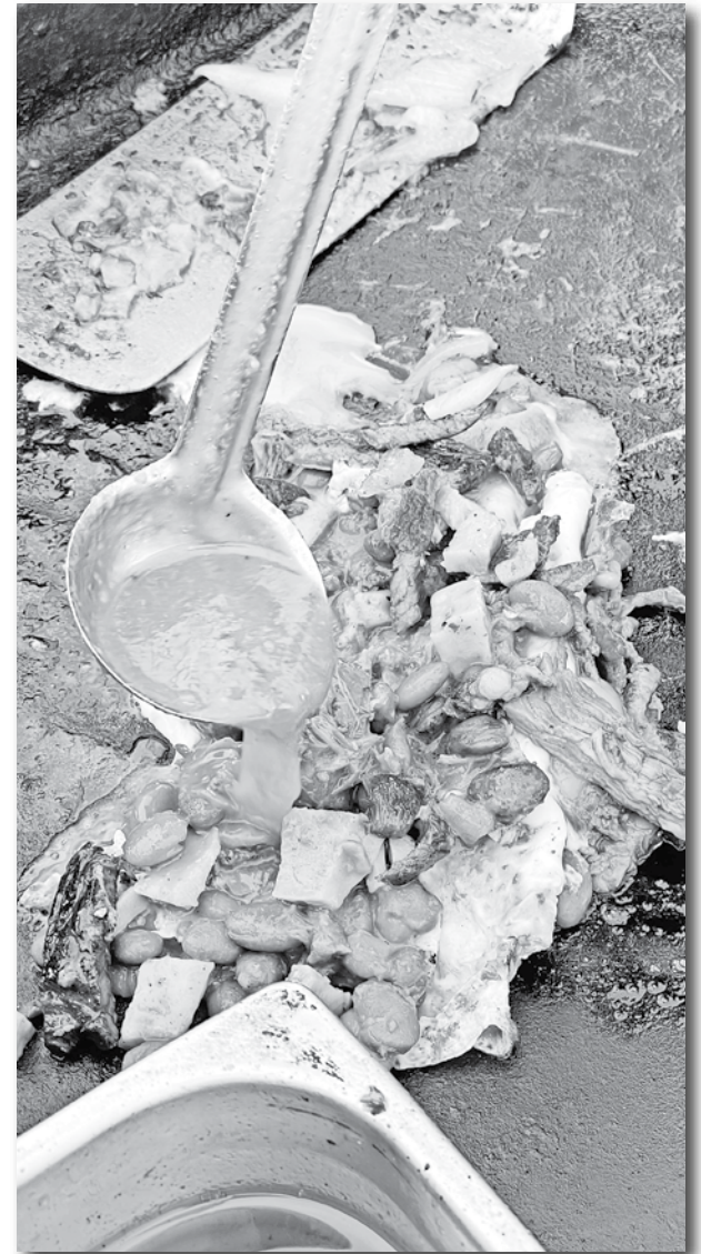
Food vendors kept the crowd fed with tasty creations.