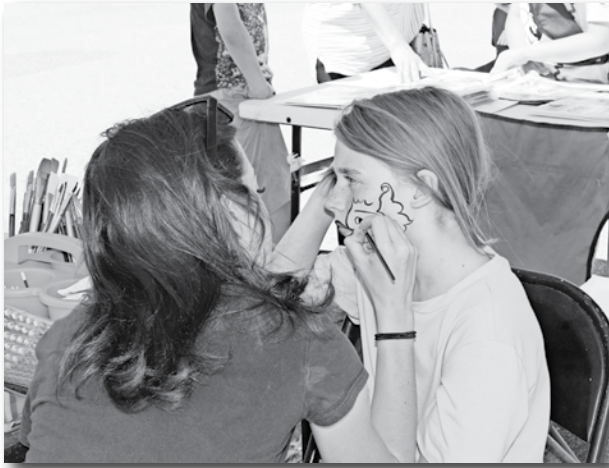
Face painting was very popular at the chili cookoff.