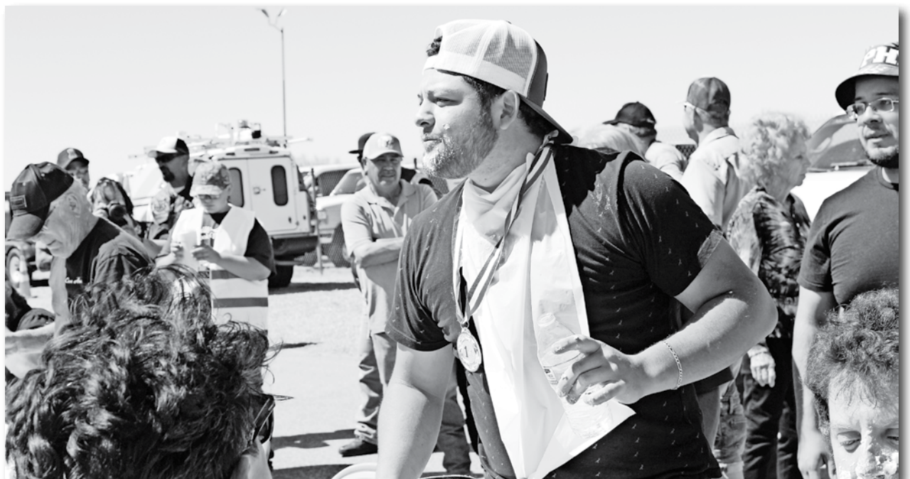
The Pie Eating Contest winner.