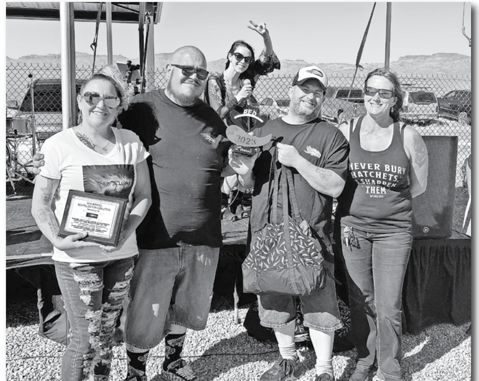
Red Chili Winners – Phat Flavors.