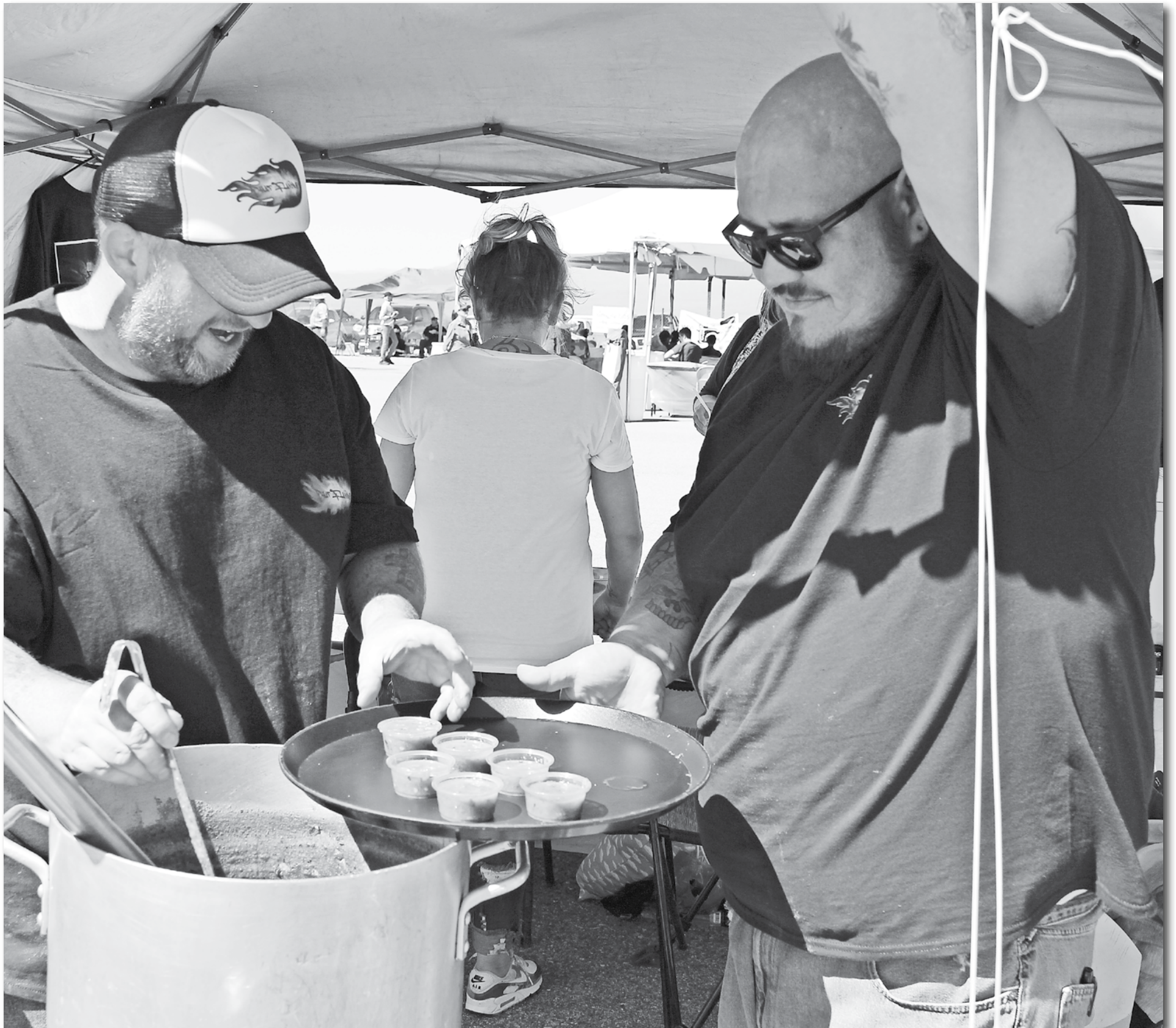
Phat Flavors' booth at the second annual San Manuel Chili Cookoff.