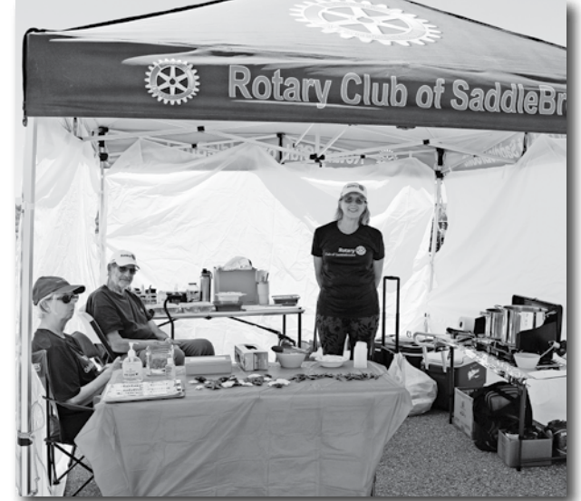
The booth set up by SaddleBrooke's Rotary Club.