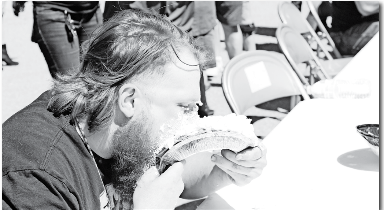
The Pie Eating Contest drew adults this year as competitors.