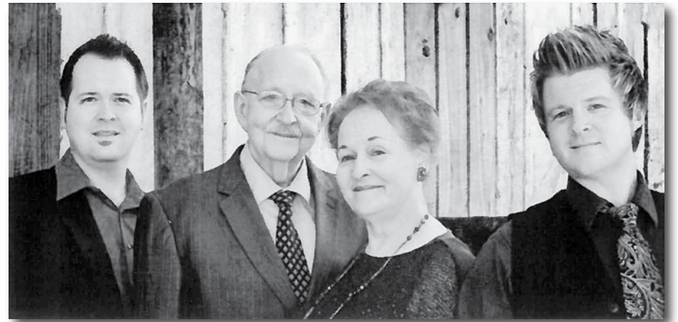
Dantts to perform Sunday in Dudleyville.