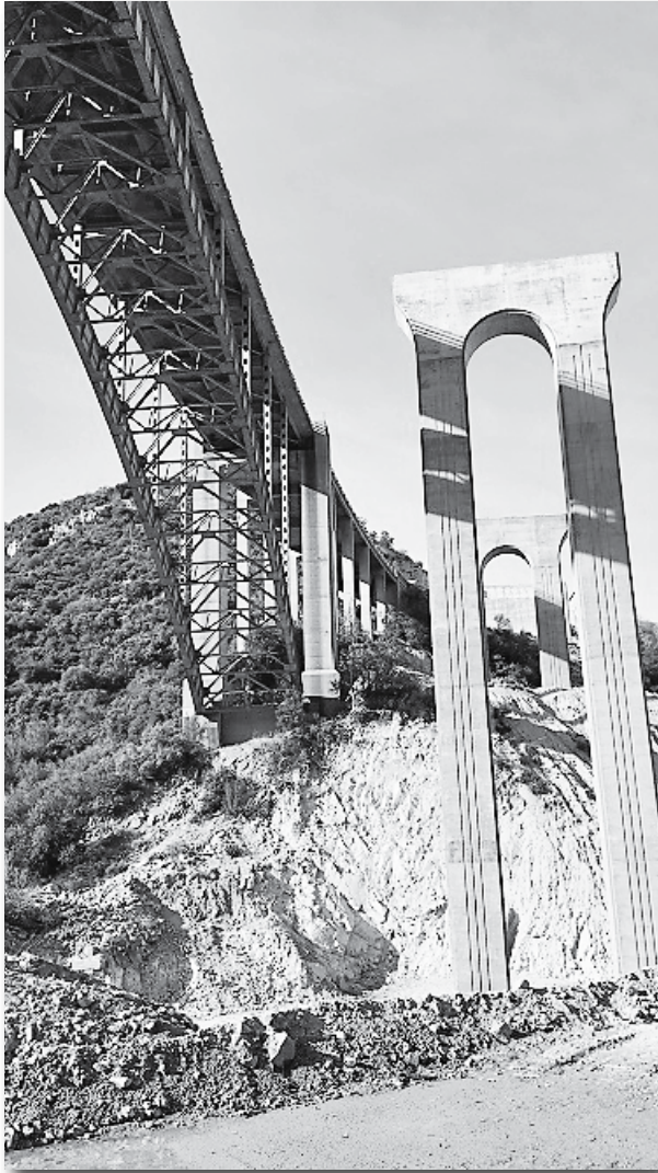
The new Pinto Creek Bridge is being constructed alongside the old bridge.