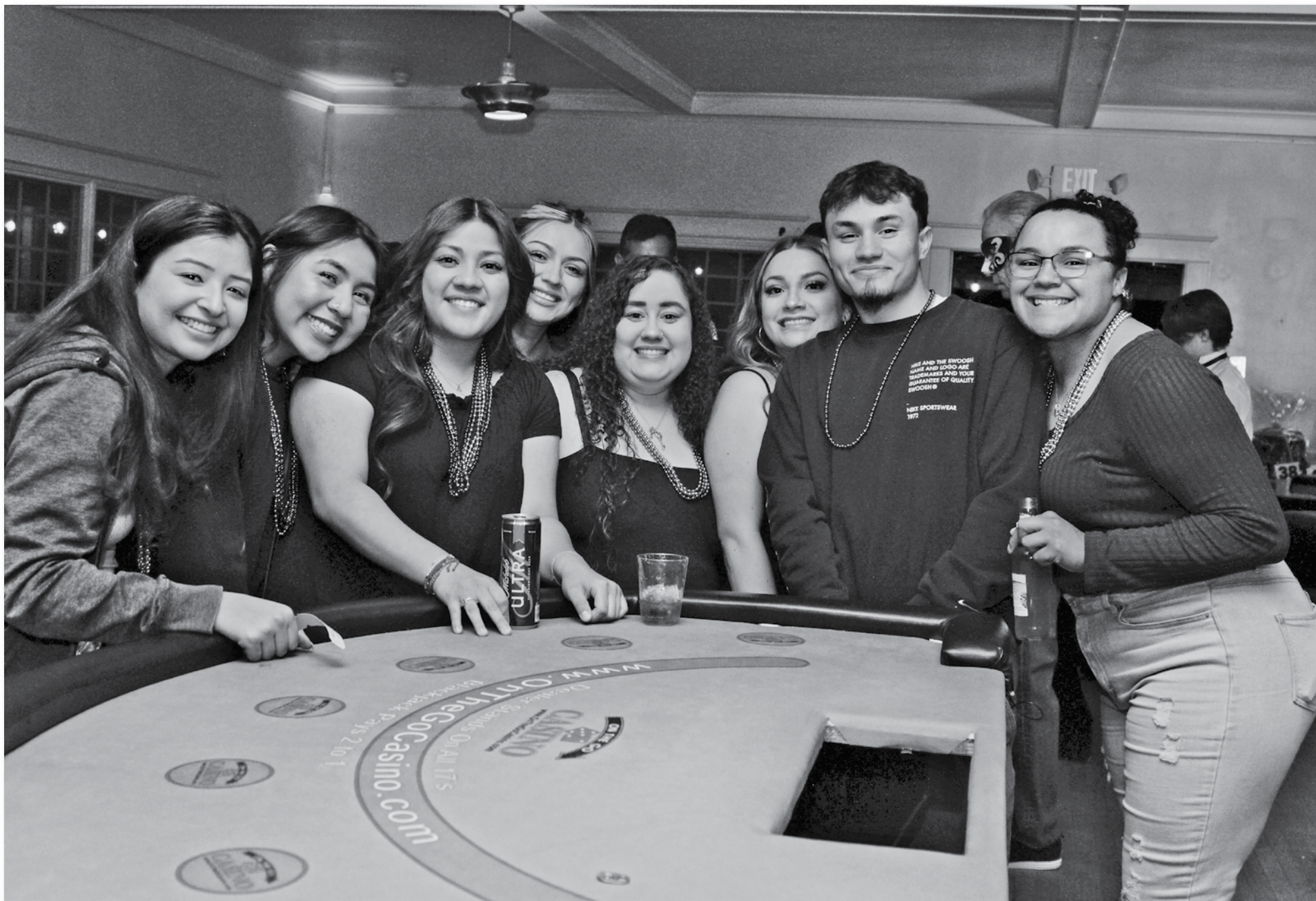
Folks have some Mardi Gras fun at the Magma Royale event by Superior Optimist Club.