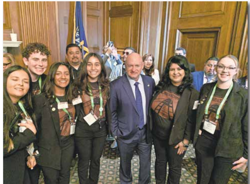
Members of the Town of Superior Youth Council with Senator Mark Kelly.