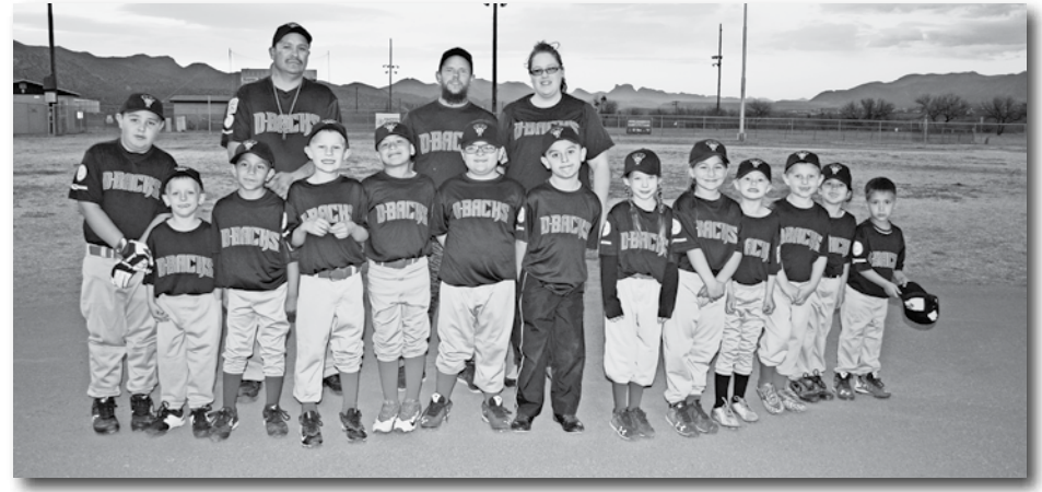
After introducing the teams, it was time to play ball. Kearny Little League's opening ceremonies for T-Ball and Coach Pitch were held early last week.