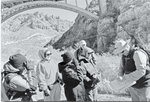
LOST's Hashbrowns, Hiking and History offers a fresh perspective on Superior's hiking trails.