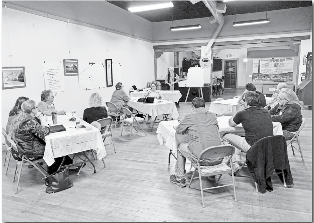
Jim Schenck | Submitted

Rebuild Superior is fundraising until April 12 through the "A Community Thrives" program to raise at least $3,000 using the online Crowdrise website ( http://bit.ly/2CLEVsb ) which will put Rebuild Superior in competition for support grants.