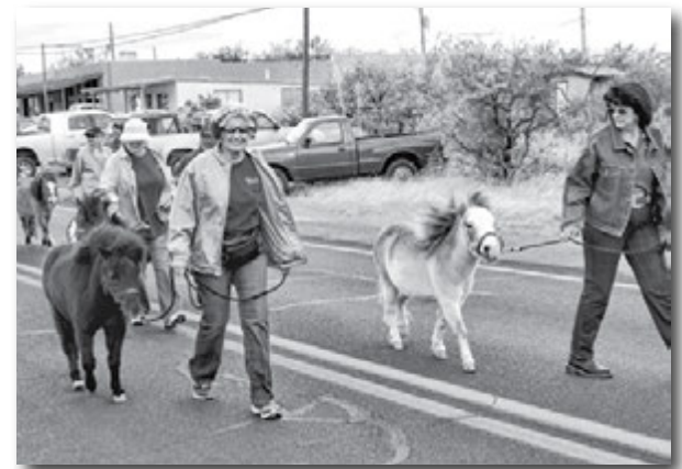
Little Hooves and Big Hearts