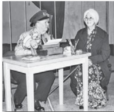
SPATS actors perform 'Welfarewell' at the theater in Oracle.

matinee, May 4 at 2 p.m.; May 9 and 10 at 7 p.m. with a final Sunday matinee on May 11 at 2 p.m. For reservations call 520-896-9496.