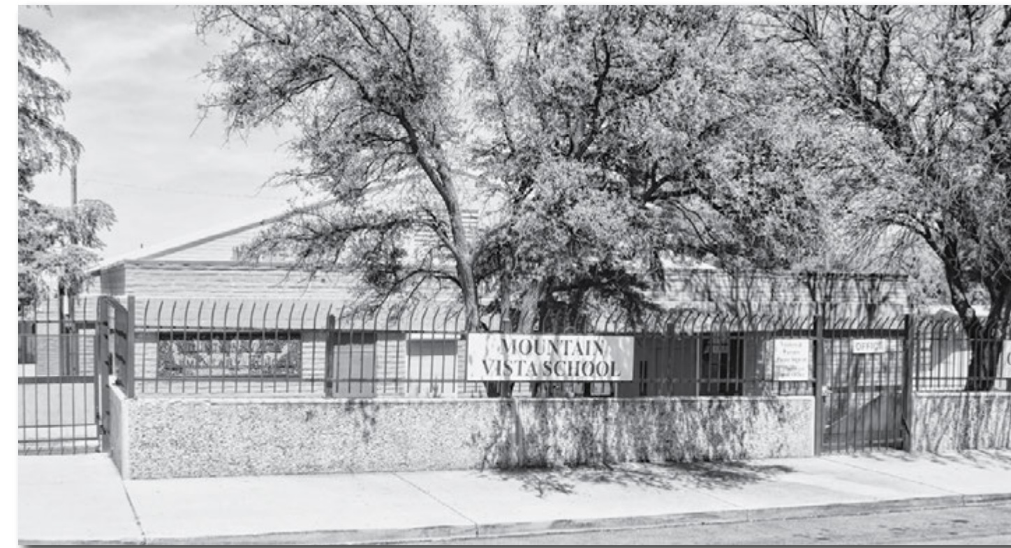
Mountain Vista School in Oracle will be able to upgrade its 'lockdown' procedures thanks to a grant award.