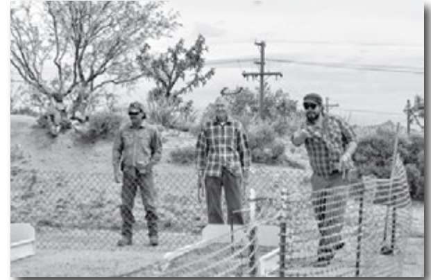
Horseshoes at the Oracle Community Center