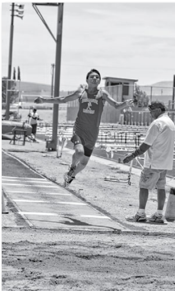
A Miner leaps in the long jump.