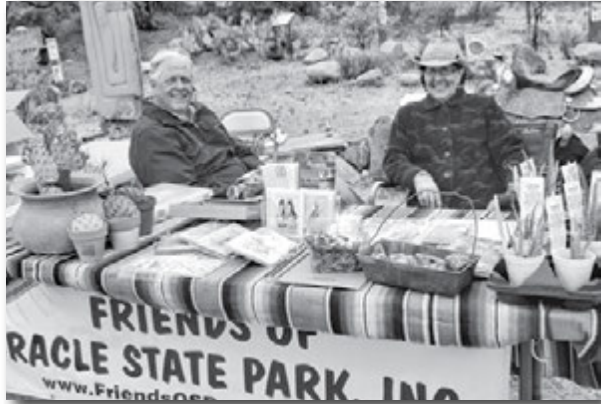
Friends of the Oracle State Park