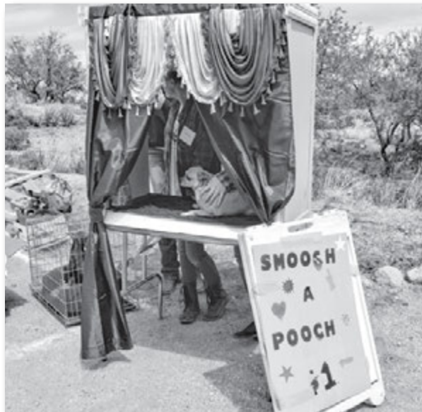
Charlotte's Way Rescue's 'Smooch a Pooch'