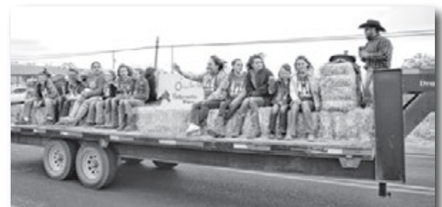
Mountain Vista School's Horsemanship