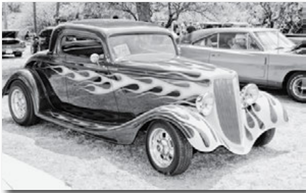
Best Paint-Leonard Kasprzak