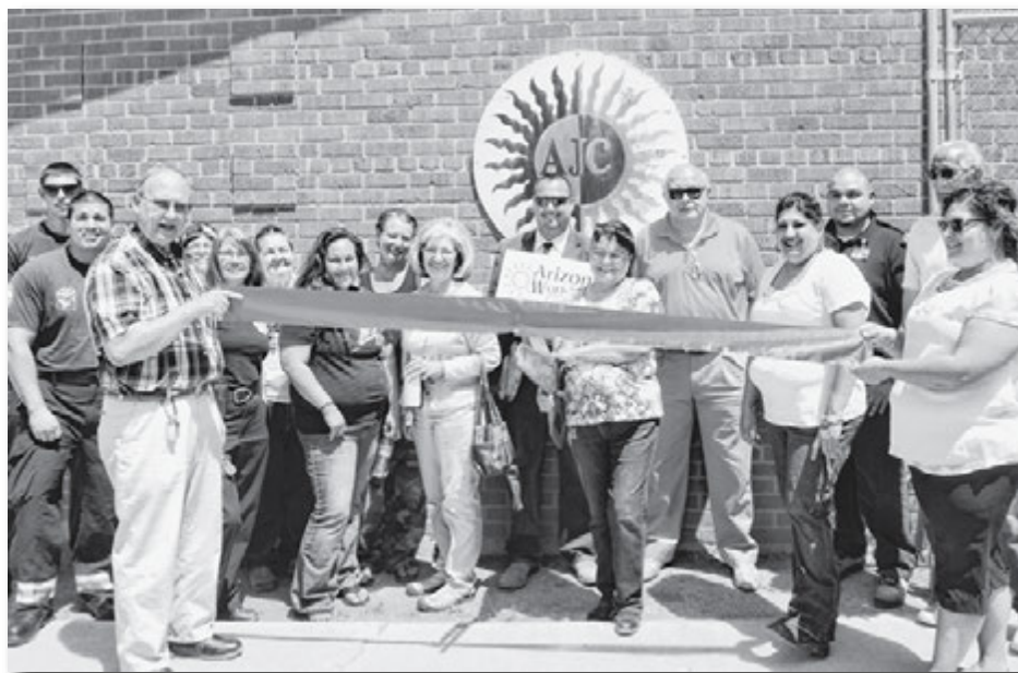
Dignitaries cut the ribbon making the Arizona Workforce Connection officially open for business.

Adult services and programs include: basic skills education; career development; GED pre-testing and preparation; on-the-job training; referrals to community agencies; and career and educational training. A one stop center is also available in Mammoth at the Mammoth Library. The two new one stop centers are a welcome addition to the Tri-Community and will provide much needed services to the people of the community. If you have a computer and would like to learn more about the Arizona Workforce Connection and the WIA visit their website: www.azjobconnection.gov . Better yet, visit the one stop center at the El Centro Youth Center.