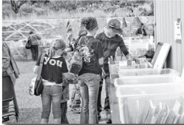
Oracle Public Library's Book Sale