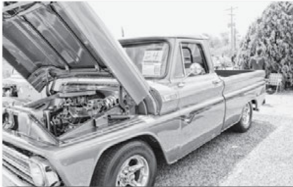
Best Engine- Ken Kempton