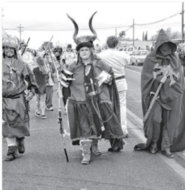
Celtic Shaman Warriors of Oracle

Most Beautiful #3 car won (2014 Fusion Plug in Energi) Most Humorous Little Hooves & Big Hearts Most Historical Massey Owners of Oracle Farm Tractors Most Original Desert Willow Aikido Best Design Cadillac Chaparral Most Colorful Kowpoke Creations Best Use of Local Materials Fur's A-Flyin Best Costume Celtic Shaman Warriors of Oracle Most Enthusiastic Mt. Vista Horsemanship Program To view the highlights of the Festival, please visit the online gallery at http://bit.ly/1mPN100