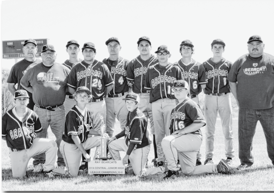
The Ray Junior Bearcats won the Central Junior League Championship, remaining undefeated through the entire season.