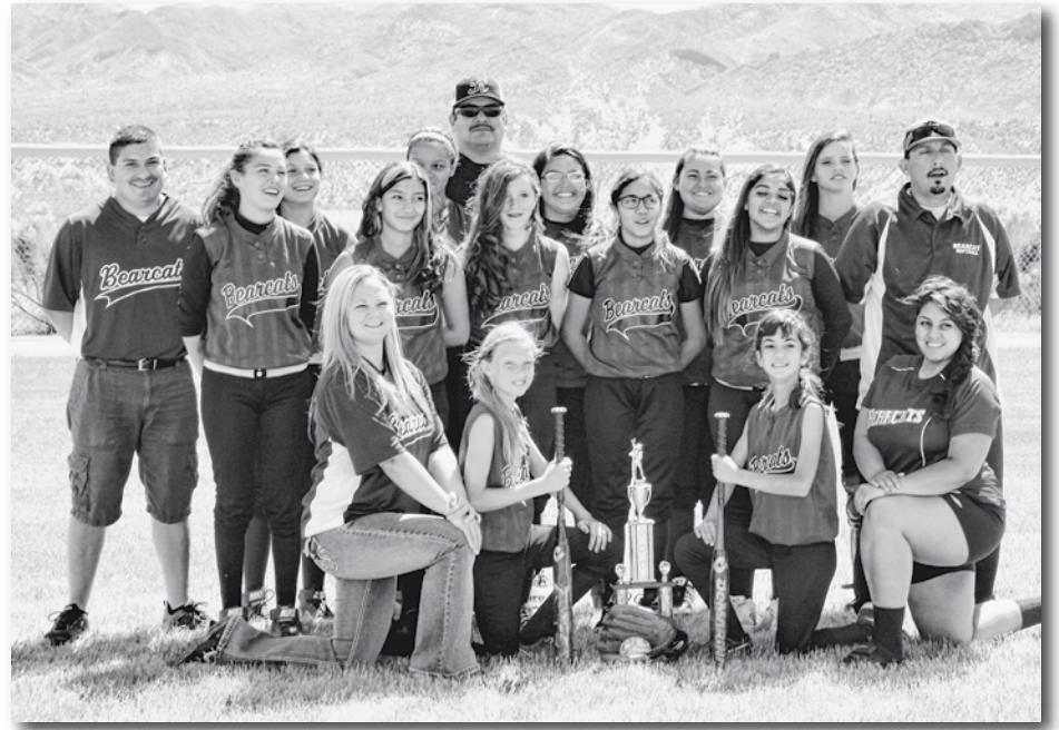
The Ray Junior Lady Bearcats took second place in the Central Junior League Championship.