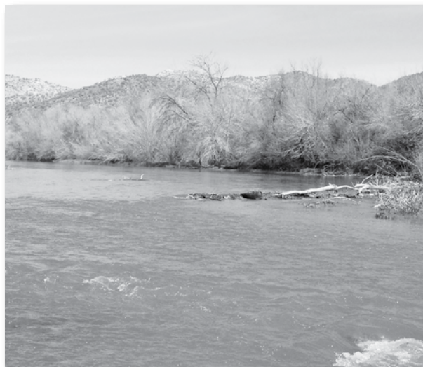
The San Pedro River Festival will take place in the Winkelman Flats on the bank of the Gila River.

on becoming a vendor or registering for one of the guided bird walks please call the CCEDC at 520-490-8433 or email at discovercoppercorridor@gmail.com . You can also visit their website at www.discovercoppercorridor.org .