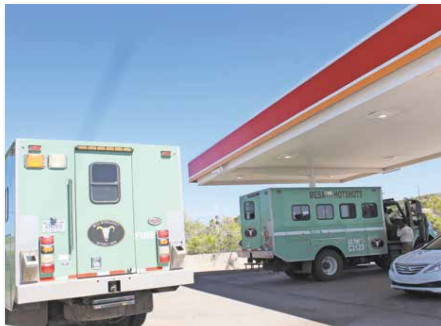
Mesa Hotshots fire crews were seen in Oracle on Thursday, April 23. One of the firefighters said they are “staging” in the area. The fire potential is high in Oracle.