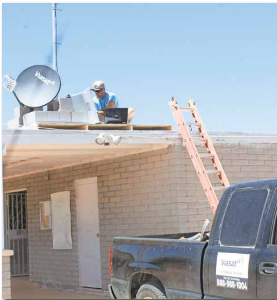
A technician with ViaSat installs a satellite WiFi receiver on the roof of the Mammoth Swimming Pool. The WiFi is for student use.