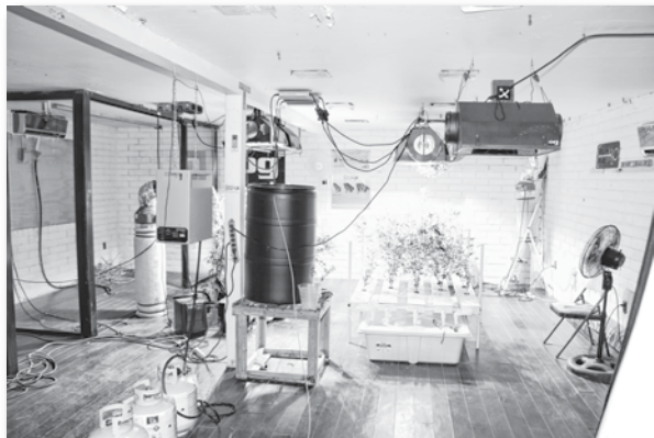
Sheriff's Deputies raided an illegal marijuana grow facility in Oracle last week.