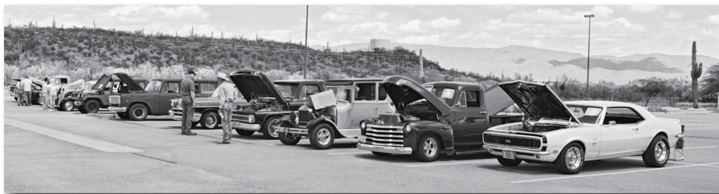
Aravaipa's car show was small but the vehicles were impressive.

Thank you again for the sponsors and for Central Arizona College for allowing the Car Show to be held at their Aravaipa facility.