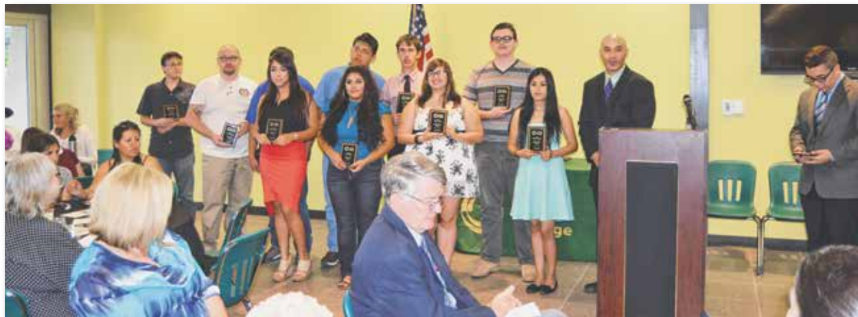
Students at CAC Aravaipa were honored last week. Pictured above are the Academic Plus Award winners.

Congratulations to all the award recipients and may they continue to be successful in all their future endeavors!