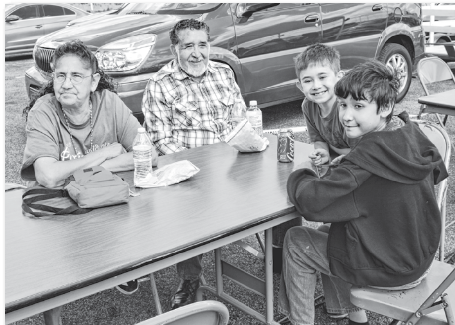
Families had fun at the Fiesta de la Primavera