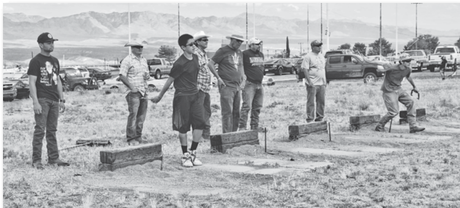
Horseshoe tournament players.

Thank you for everyone that participated in making this another triumphant event!