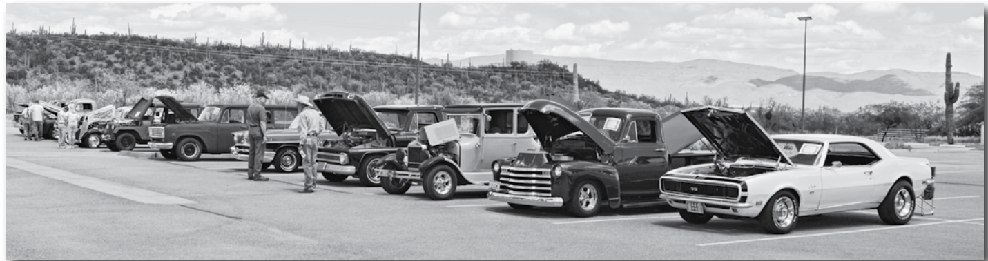
Aravaipa's car show was small but the vehicles were impressive.

Thank you again for the sponsors and for Central Arizona College for allowing the Car Show to be held at their Aravaipa facility.