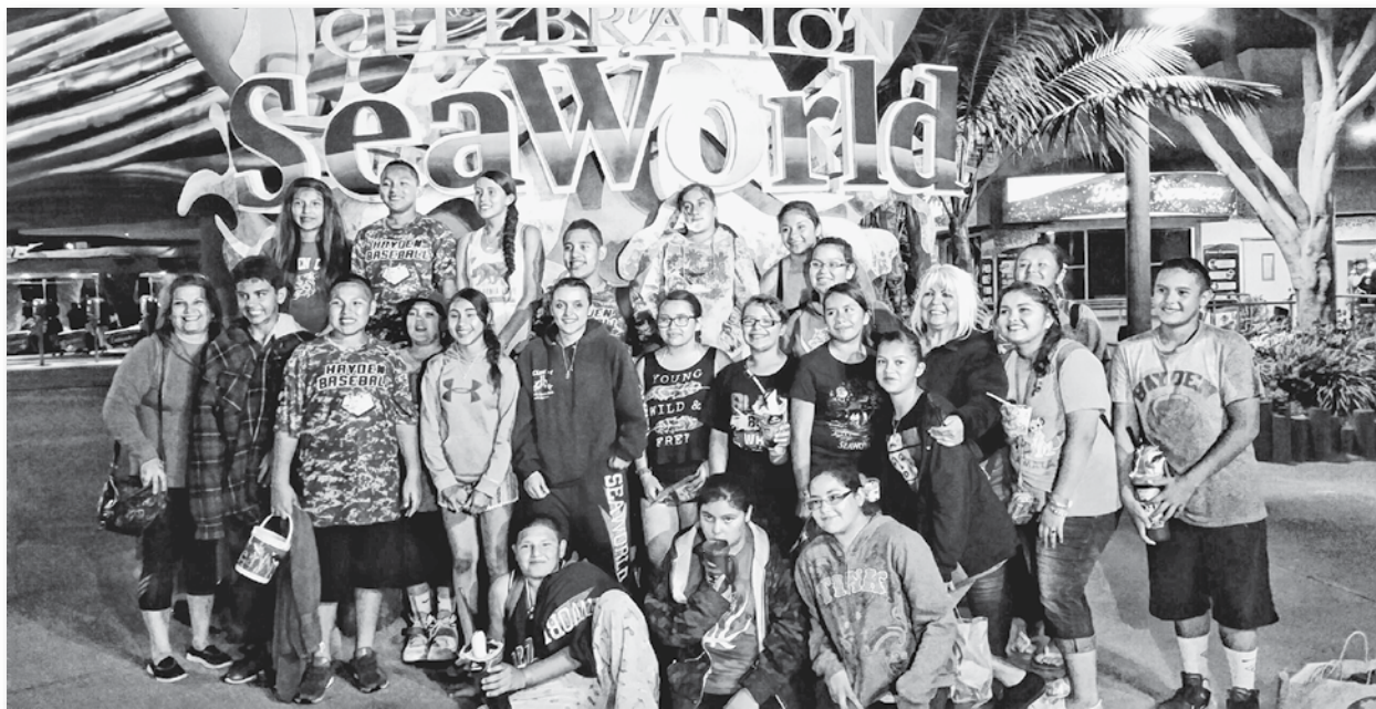
Twenty-three students in grades six through eight from Leonor Hambly K-8 visit Seaworld. Because of positive behavior and good grades, these students are enjoying incentive trip!