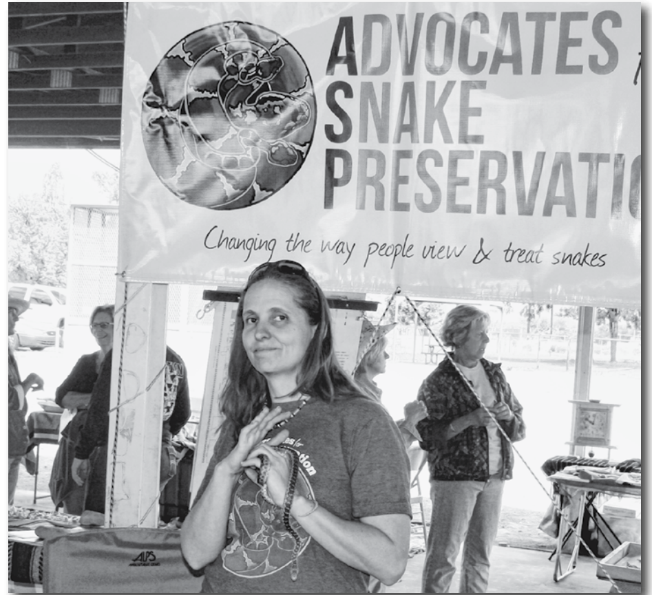
Advocates for Snake Preservation sought to educate Festival goers.