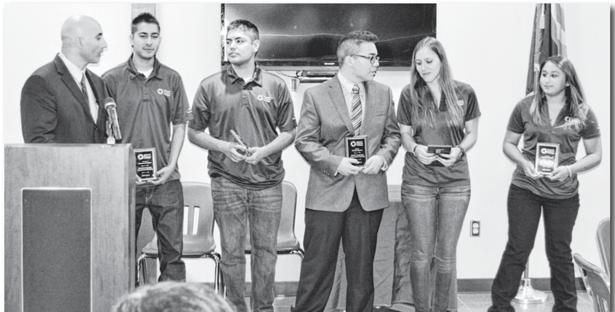
CAC recognized the student leadership at Aravaipa.