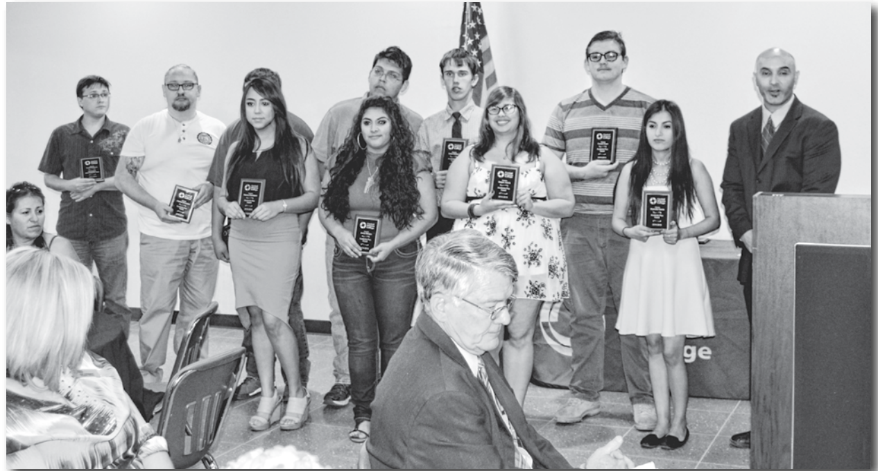
Students at CAC Aravaipa were honored last week. Pictured above are the Academic Plus Award winners.

Congratulations to all the award recipients and may they continue to be successful in all their future endeavors!