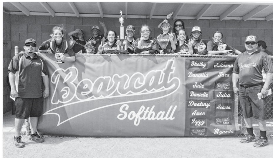
Ray Junior High School Lady Bearcats – Champions