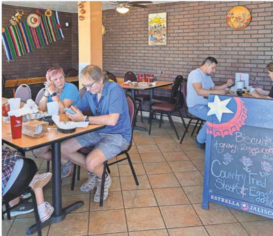
Customers at Casa Dona Lola love the food. Casa Dona Lola serves Mexican American food as well as American cuisine.