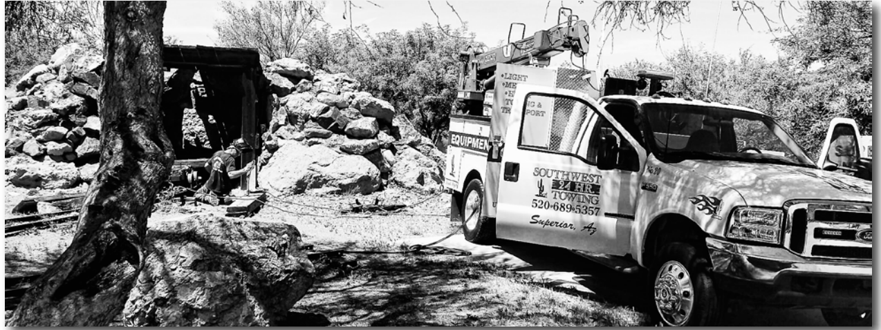
Southwest Towing offered its assistance in cleaning up the damage caused by vandals.

Anyone having information on the vandalism are asked to call police to report it. Citizens can call Silent Witness at 1-800-358-INFO, Crime Stop at 689-5611 or the Information Tip Line at 520-827-0065 if they have information that may help the police department.