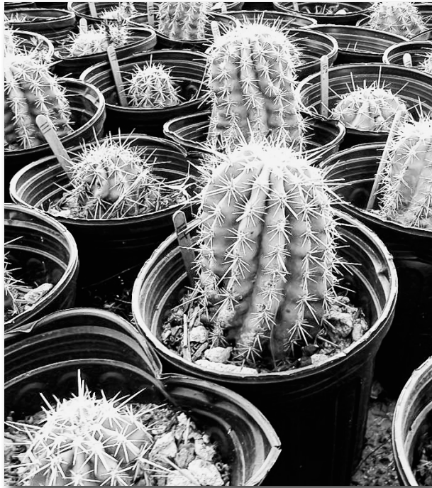
Approximately 1,000 endangered Arizona Hedgehog cactus grown on Resolution Copper's JI Ranch were collected and replanted.