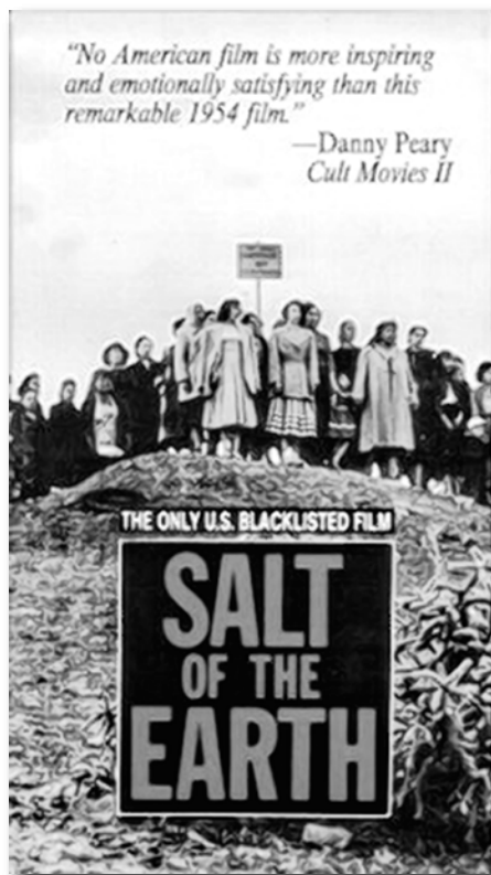
Movie poster from Salt of the Earth.

If you missed the first part of this story, read it online at: http://bit.ly/1L6QWEo . You can read Part 2 online at: http://bit.ly/1RBOLbw . Part 3 can be read online at: http://bit.ly/1YQHJBQ .