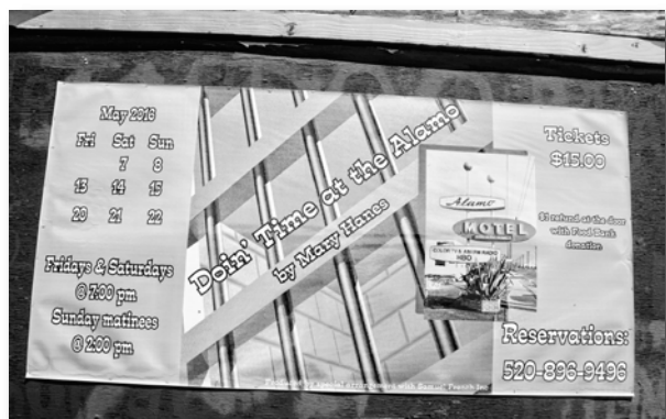
The marquee at the SPATS Playhouse.

The San Pedro Actors Troupe Playhouse is located at 730 American Avenue. Call (520) 896-9496 for reservations.