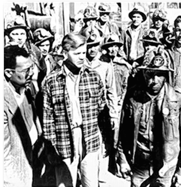
Scene from Salt of the Earth – Miners Before They Strike.